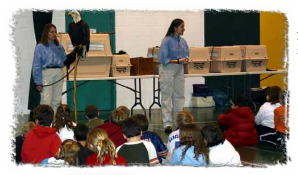
Area students look at a live bald eagle during a bald eagle program at the Peru, Ill., YMCA. The event was part of the ILWW sponsored events held during the weekend of Jan. 22-23.