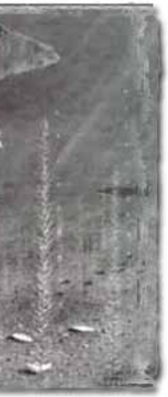
A Northern Pike is attracted by a fish decoy beneath a darkhouse in this illustration by Les Kouba titled, "Darkhouse Action." Graphic courtesy of Leitch 2001: Frontespiece.