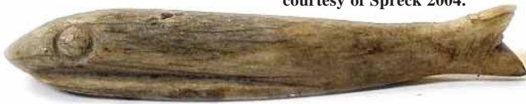
A bone or horn fish decoy of possible Native American manufacture is shown.