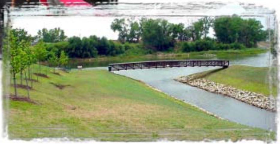
(Below) A scenic view of the South Lake portion of the Loves Park Creek Flood Protection Project.