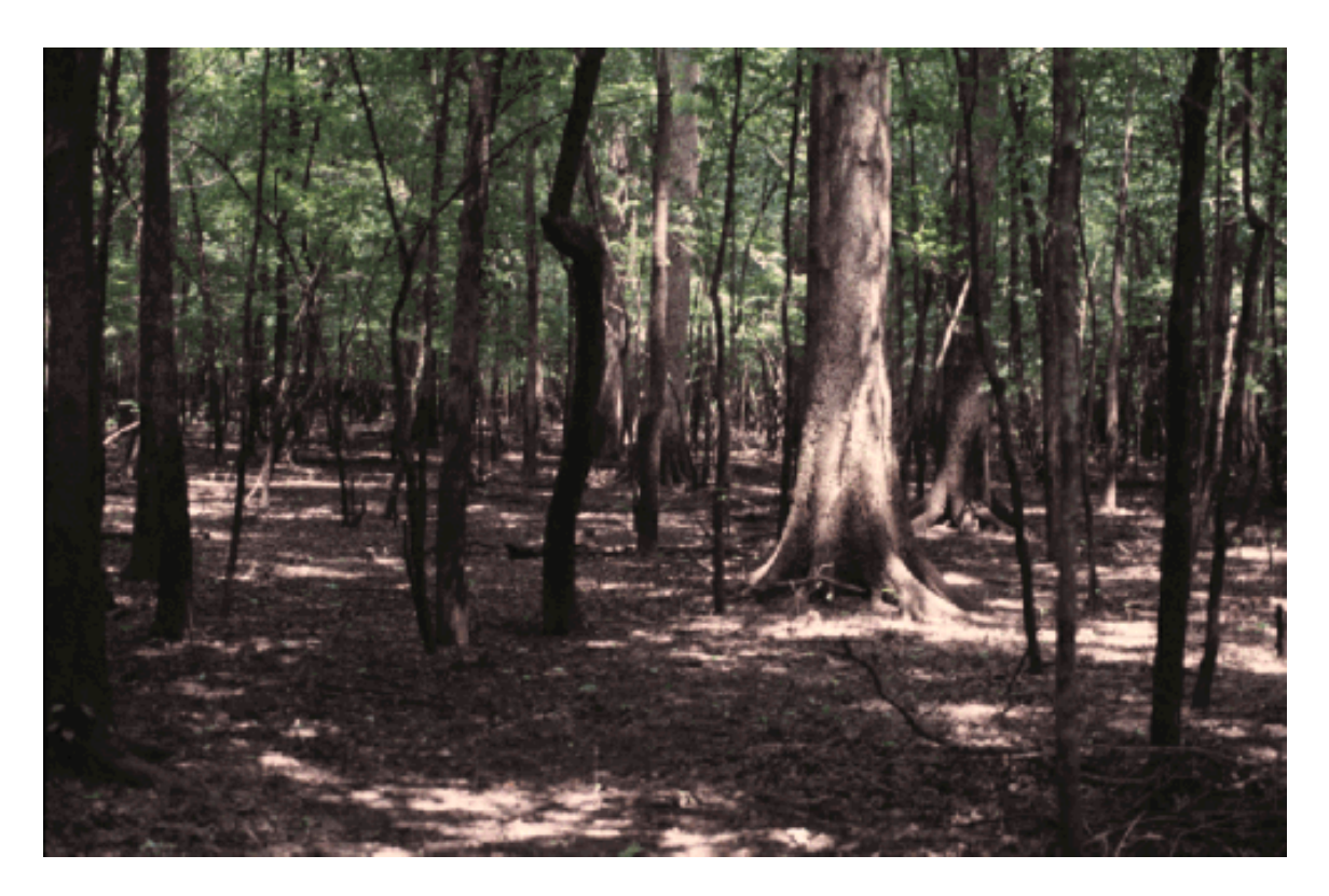
Figure 1. Typical BLH forest, Cache River, Arkansas

areas with a clay hardpan (Tansey and Cost 1990). Southern BLH provide numerous ecosystem functions (Wilkinson, Schneller-McDonald, and Auble 1987) and support a diverse plant and animal community that includes many state and Federal threatened, endangered, and candidate species (TES)¹ (Ernst and Brown 1989). Kusler (1977) suggested that although only 3.5 percent of United States land area is wetland, approximately 35 percent of all rare, threatened, and endangered wildlife species depend on wetlands for survival. Bottomland hardwood ecosystems were once widespread and abundant throughout the southeastern United States. However, their distribution has been greatly reduced to the point where BLH ecosystems are now considered threatened (Noss, LaRoe, and Scott 1995).