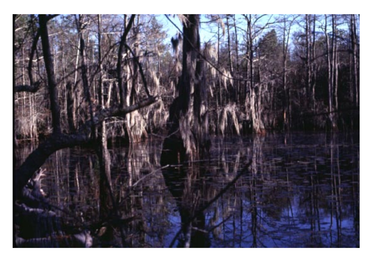
Figure 2. Deepwater swamp, southern Alabama

variations in species abundance and composition occur on a local scale, however, due to differences in hydrology and to the complex and dynamic nature of the floodplain environment (Sharitz and Mitsch 1993). Classification systems for forested wetlands, including BLH, have been developed in an attempt to describe this variation. Several of these systems classify BLH throughout the geographic range of the community. Others, such as the state classification systems developed for North Carolina (Schafale and Weakley 1990) and Florida (Ewel 1990), cover only a limited geographic area. Classification systems covering limited areas often work well on a local scale, but they have limited regional applicability (Kellison et al. 1998). Selected classification systems are discussed below.