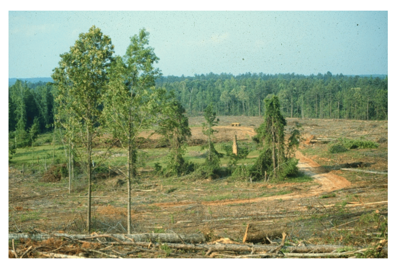
Figure 4. Timber harvesting in and adjacent to BLH is among many land-use practices contributing to loss of habitat

In deepwater swamps, natural regeneration of baldcypress was poor to nonexistent following logging operations (Conner, Toliver, and Sklar 1986), because swamps remain flooded for much of the year (Conner 1994). Baldcypress seeds cannot germinate in standing water (Demaree 1932) nor do they grow tall enough to survive frequent flooding (Conner 1994).