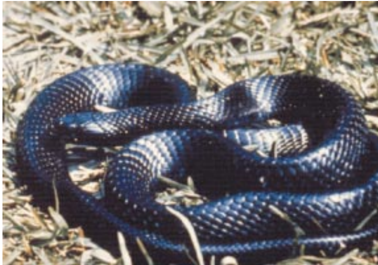
Eastern Indigo Snake; photo courtesy of the Florida Agricultural Information Retrieval System