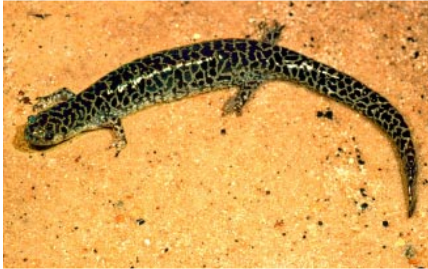
Flatwoods Salamander