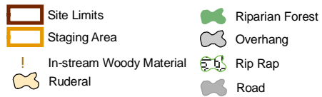
Image Source AirPhotoUSA May 2006. Current site conditions may vary from those shown on aerial photo.