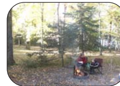
Relax by a Campfire