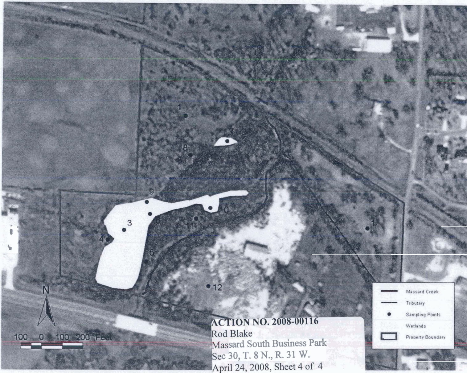
Figure 4. Aerial photograph showing sampling site locations and other waters of the US, based on Sebastian DOQQ IR.