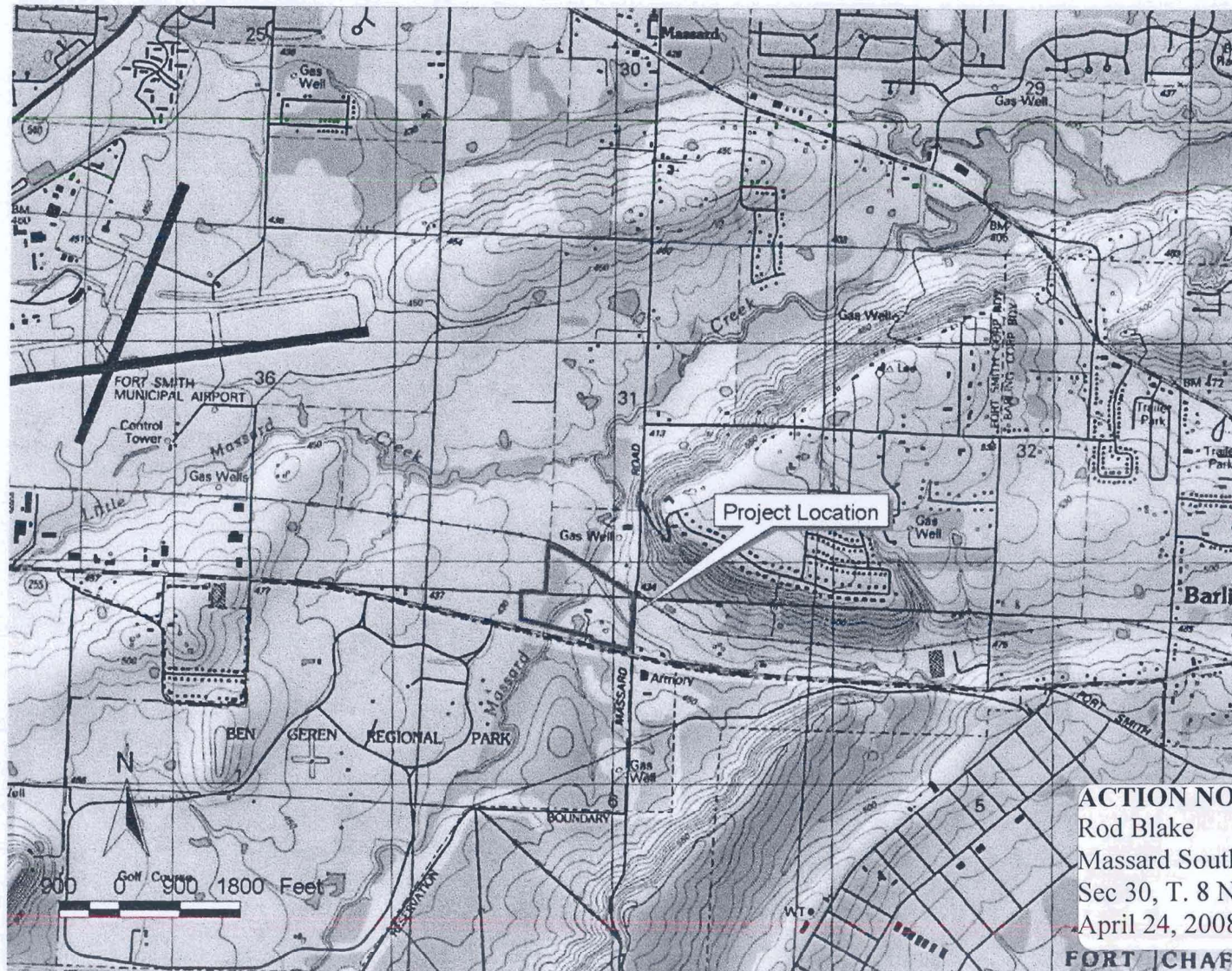
Figure 2. Map showing an overview of the project area, (parts of Section 6, Township 7 North, Range 31 West and Section 31, Township 8 North, Range 31 West), based on USGS topographic quadrangle map Barling, ARK (7.5-minute series).