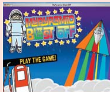
Figure H: MyPyramid Blast Off Game

The MyPyramid Blast Off game provides an example of how an interactive computer game with fantasy elements can help motivate children to learn