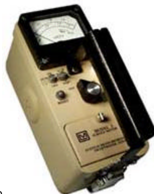
Ludlum Model 3