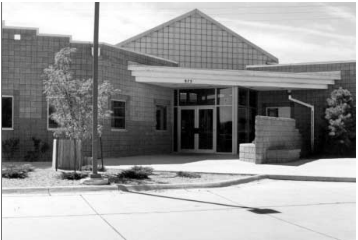
Panhandle Community and Migrant Health Center, Gering, Nebraska