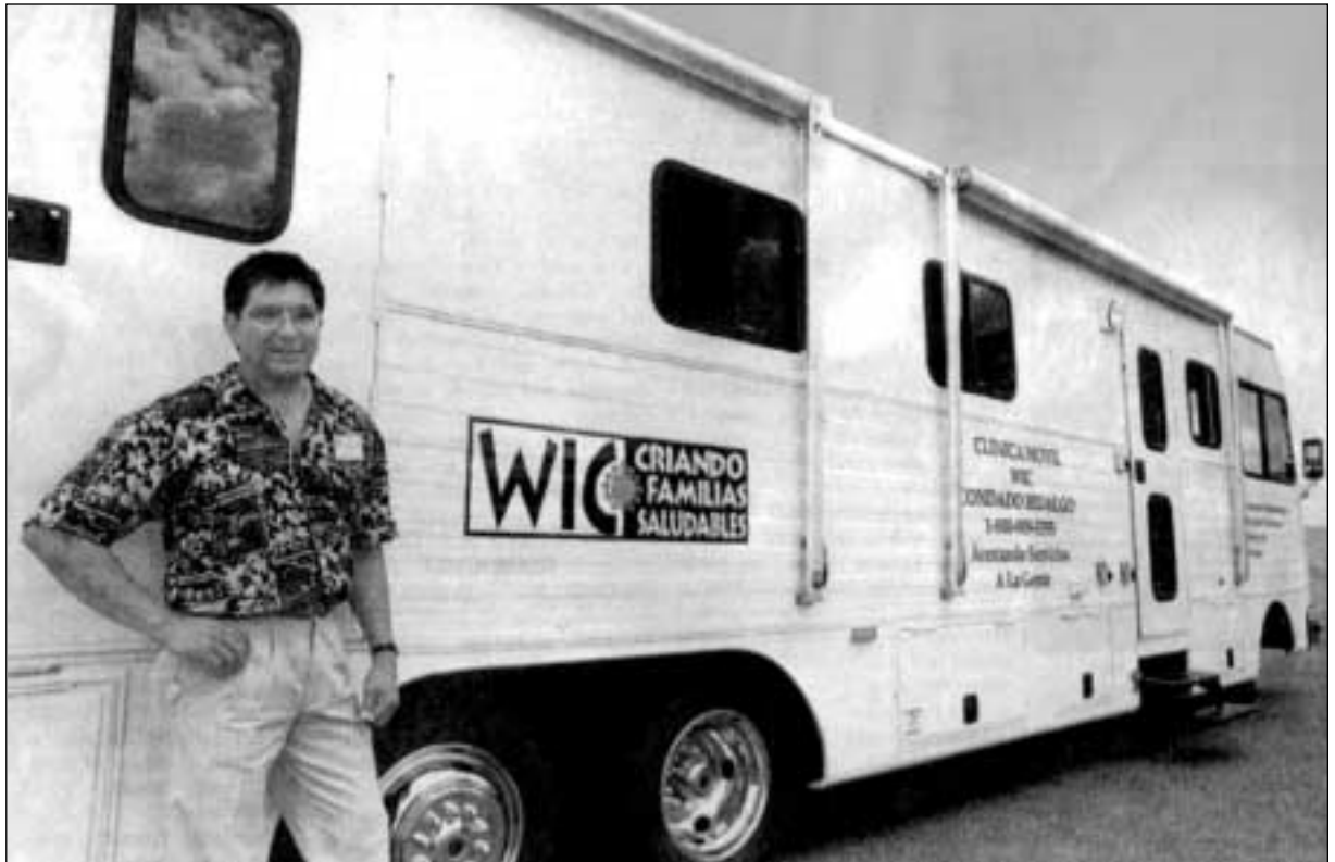
Hidalgo County WIC Program Mobile Van, Pharr, Texas

Executive Director Hidalgo County Health Care Corporation 1203 East Ferguson Pharr, TX 78577 Tel: (956) 787-8915 Fax: (956) 781-4384