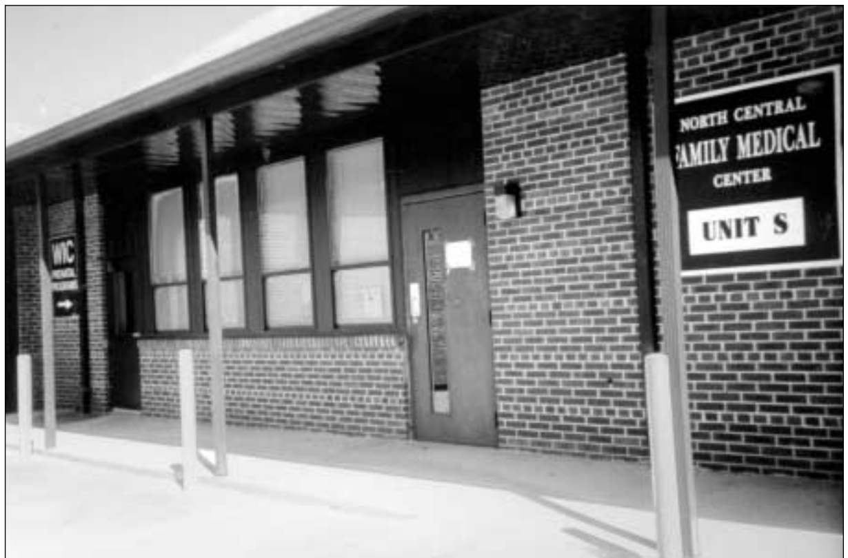
North Central Family Medical Center, Rock Hill, South Carolina