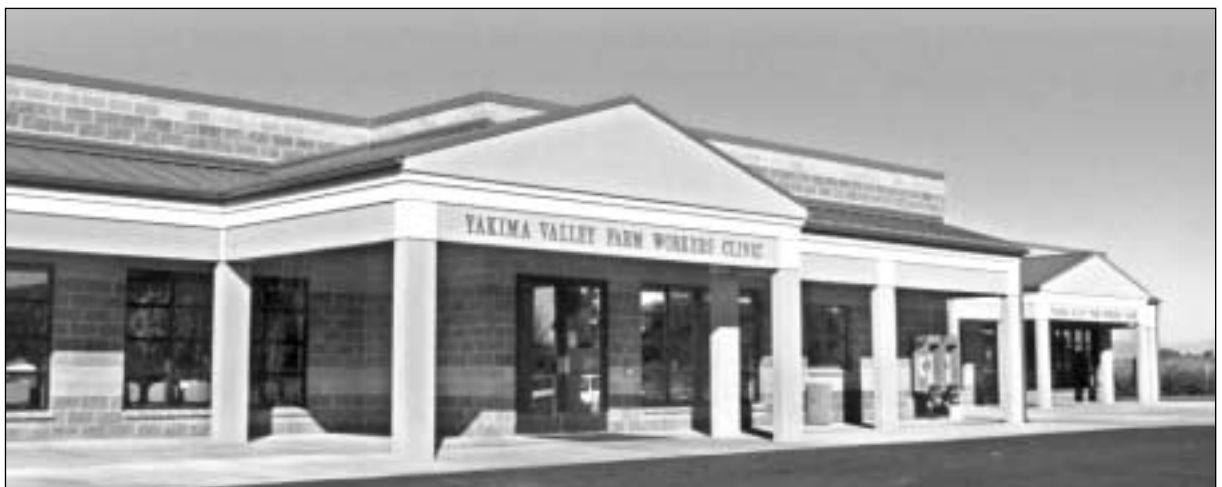
Yakima Valley Farm Workers Corporation, Yakima, Washington