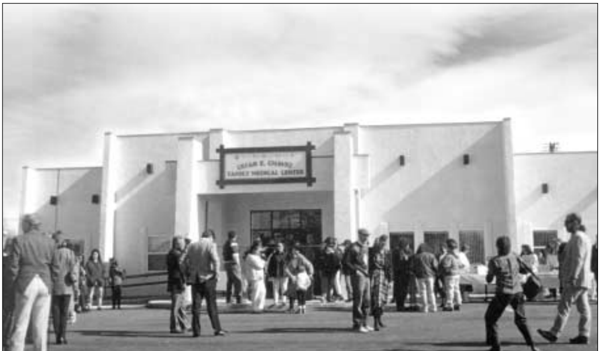
Valley-Wide Health Services, Alamosa, Colorado

Vice President of Operations Valley-Wide Health Services, Inc. 204 Carson Street Alamosa, CO 81101 Tel: 719-589-5161 Fax: 719-589-5722