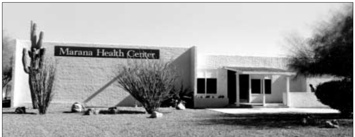
Marana Health Center, Marana, Arizona

Medical Assistant Marana Health Center 13644 N. Sandario Road Marana, AZ 85653 Tel: (520) 682-4111 Fax: (520) 682-3817