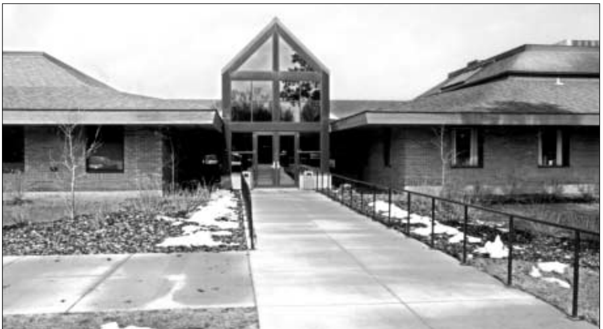
Fond du Lac Human Services, Cloquet, Minnesota

Human Services Director Fond du Lac Human Services 927 Trettel Lane Cloquet, MN 55720 Tel: (218) 879-1227 Fax: (218) 879-8378