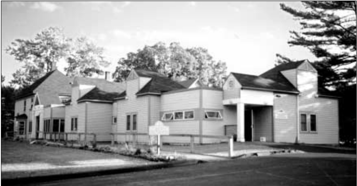
Sacopee Valley Health Center, Porter Maine

Social Services Manager Sacopee Valley Health Center 70 Main Street Porter, ME 04047 Tel: (207) 625-8126 Fax: (207) 625-7820