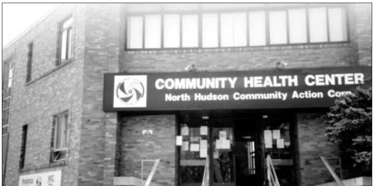
North Hudson Community Action Corporation, West New York, New Jersey

President/CEO North Hudson Community Action Corp. 5301 Broadway West New York, NY 07093-2622 Tel: (201) 866-2388 Fax: (201) 330-3803