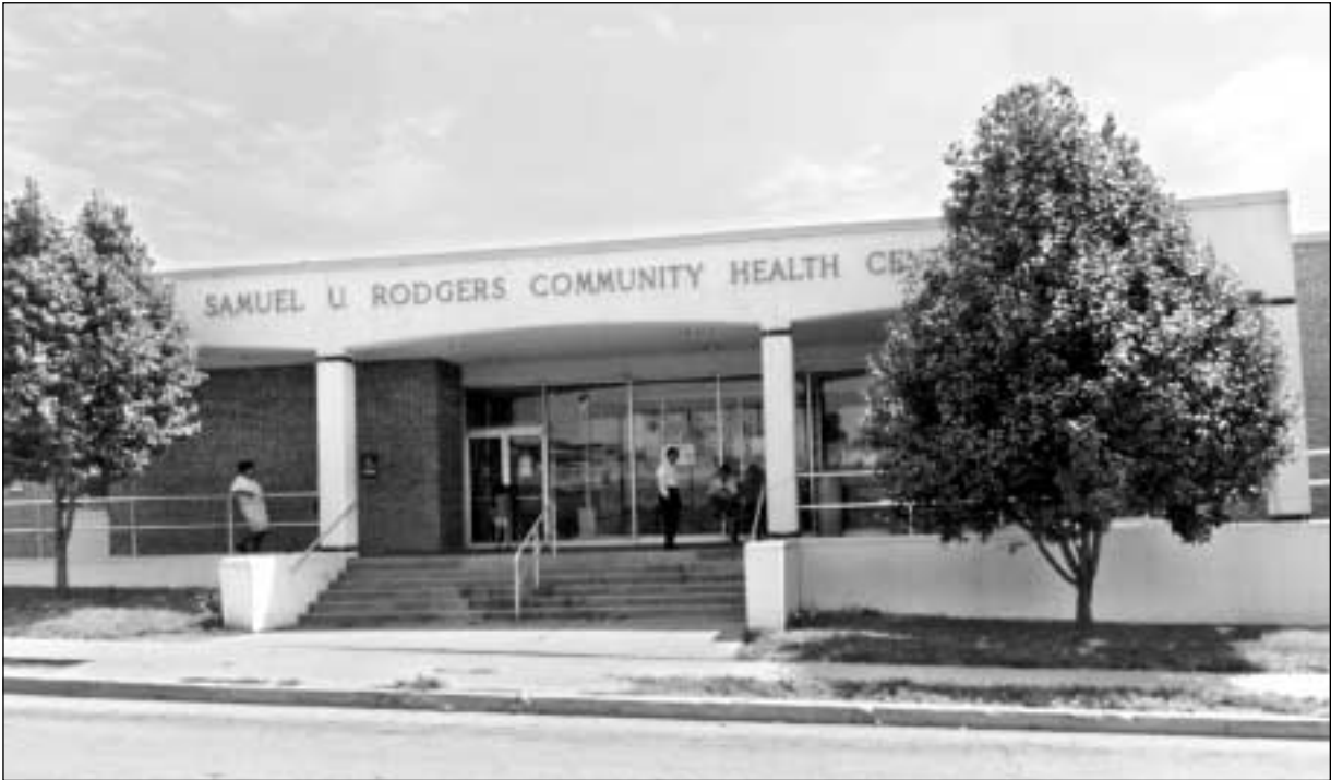
Samuel U. Rodgers Community Health Center, Kansas City, Missouri

Administrator 825 Euclid Samuel U. Rodgers CHC Kansas City, MO 64124 Tel: (816) 474-4920 Fax: (816) 474-6475