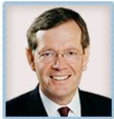
Posted by Michael O. Leavitt Secretary, The U.S. Department of Health and Human Services