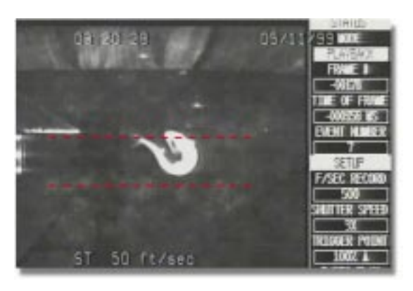
Fish recorded by high-speed video being exposed to shear zone downstream of laboratory jet.

mizing the damage to fish and their habitats. Development of environmentally friendly hydroelectric turbines requires knowledge of the physical