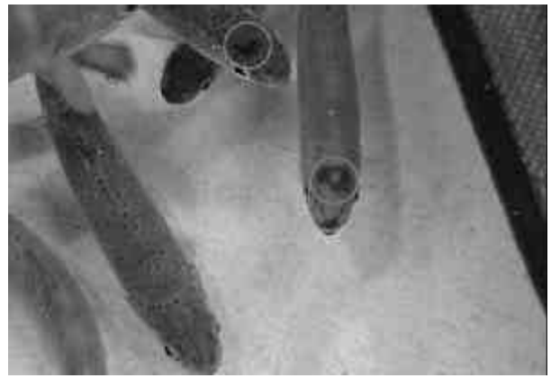
Some rainbow trout developed a black spot on the top of their heads during the 48-hour observation period following simulated passage through a Kaplan turbine. This injury was more frequent in depth-acclimated than surface-acclimated fish.

Nadirs of 68 kPa and 95 kPa: Only one spike-related death occurred in depth-acclimated fish from exposure to 68 kPa. No other deaths occurred for depth- or surface-acclimated fish exposed to 68 or 95 kPa. Injuries (internal hemorrhaging of blood vessels near the