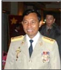
General Thura Shwe Mann

Specially Designated Nationals Pursuant to Executive Order 13448