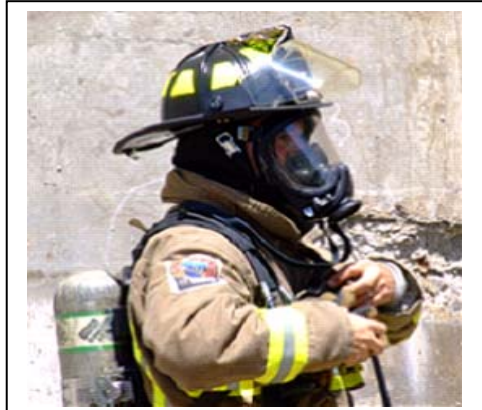
Figure 2. Responder Using Self-Contained Breathing Apparatus

Glenn's "Occupational Health Programs Manual," Chapter 4, "Respiratory Protection