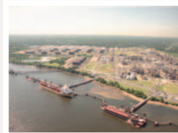
DELAWARE RIVER FEDERAL NAVIGATION CHANNEL