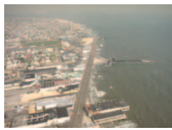
OCEAN CITY, NJ