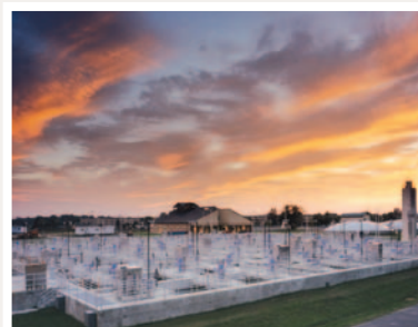
FORT DIX/McGUIRE AIR FORCE BASE TERTIARY WASTEWATER TREATMENT FACILITY