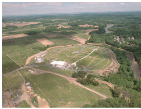
LIPARI LANDFILL SUPERFUND SITE