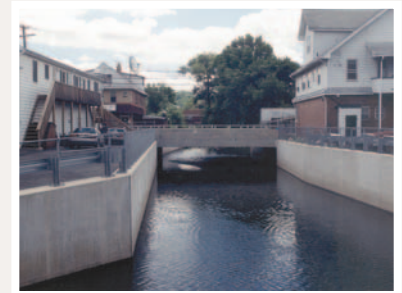
FLOOD CONTROL PROJECT AT MOLLY ANN'S BROOK

1992 Hurricane Andrew, roars ashore just south of Miami, Fla., cutting a 22-mile-wide path of destruction, killing 20 people and leaving a quarter of a million homeless and 1.4 million more without electricity. Responding in support of the Federal Emergency Management Agency, the Corps played a key role in helping the people of south Florida recover from the storm.