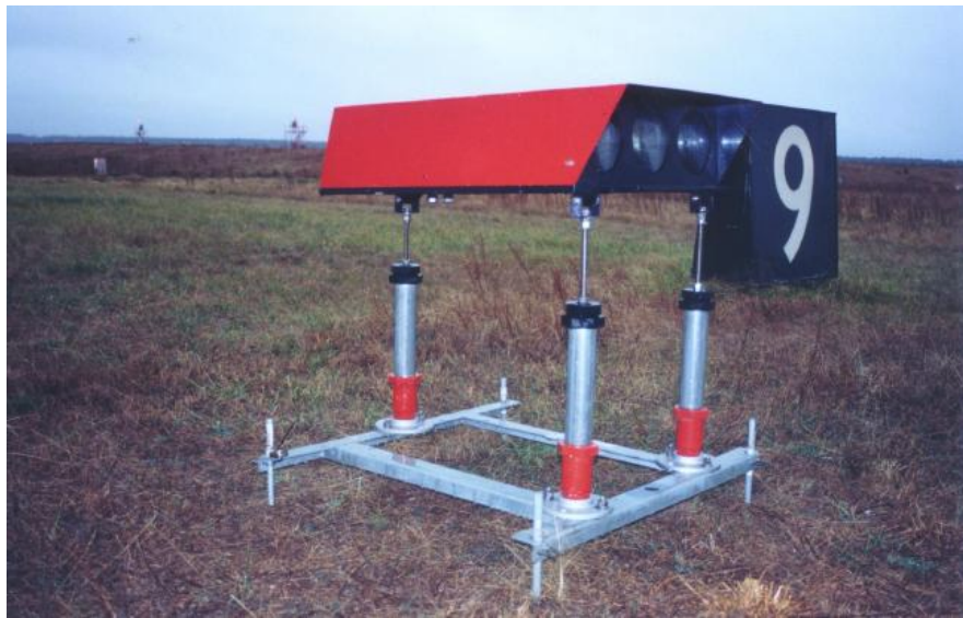
FIGURE 3. INSTALLATION OF LHA NO. 3

LHA no. 3 was also mounted to the galvanized steel framework using a standard 2" aluminum conduit, frangible couplings, and flanges. It was then secured to the ground with four 8' by 5/8" grounding rods. LHA no. 3 was secured to the grounding rods 6" above ground level. Small adjustments were then made from that point to level the unit and set the elevation to 3 degrees. This modification to the mounting procedure was done to determine whether the 5/8" grounding rods were secure enough to mount the LHA and framework on without affecting its ability to maintain its alignment settings. By mounting the LHA and framework 6" off the ground, the ground was able to shift during seasonal changes without effecting the alignment. Figure 3 shows the initial installation of LHA no. 3. Figure 4 shows the complete installation of all three LHAs.