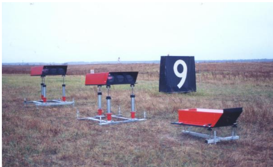
FIGURE 4. THREE LHAs INSTALLED AT AIRPORT OPERATIONS AREA