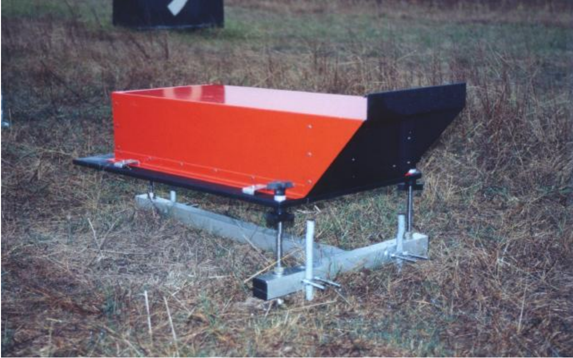
FIGURE 1. INSTALLATION OF LHA NO. 1