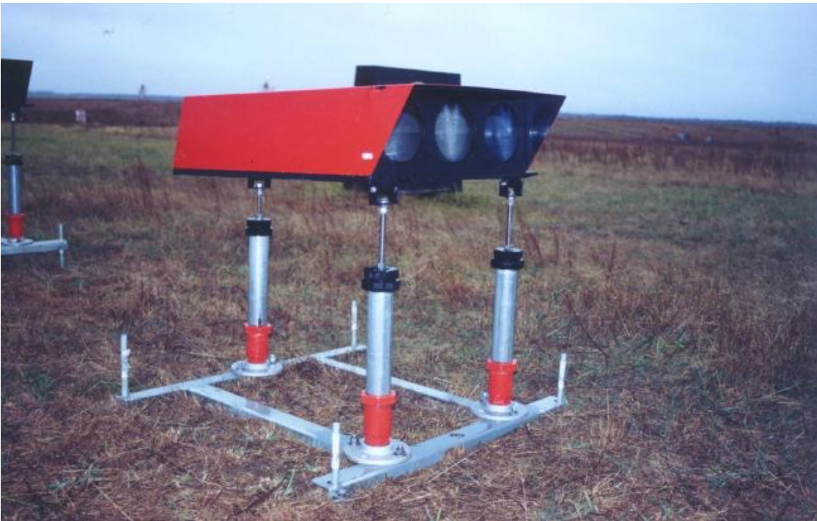
FIGURE 2. INSTALLATION OF LHA NO. 2