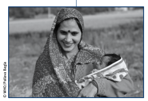
In India, about two-thirds of the people in rural areas use traditional medicine, such as Ayurveda, to help meet their primary health care needs.

Ayurvedic medicine, also called Ayurveda, is a whole medical system* that began in India and has evolved there over thousands of years. The word Ayurveda is made up of two Sanskrit words—ayur, which means life, and veda, which means