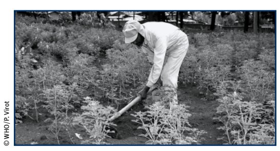
Cultivating medicinal plants, Ethiopia