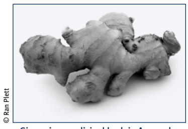
Ginger is a medicinal herb in Ayurveda.