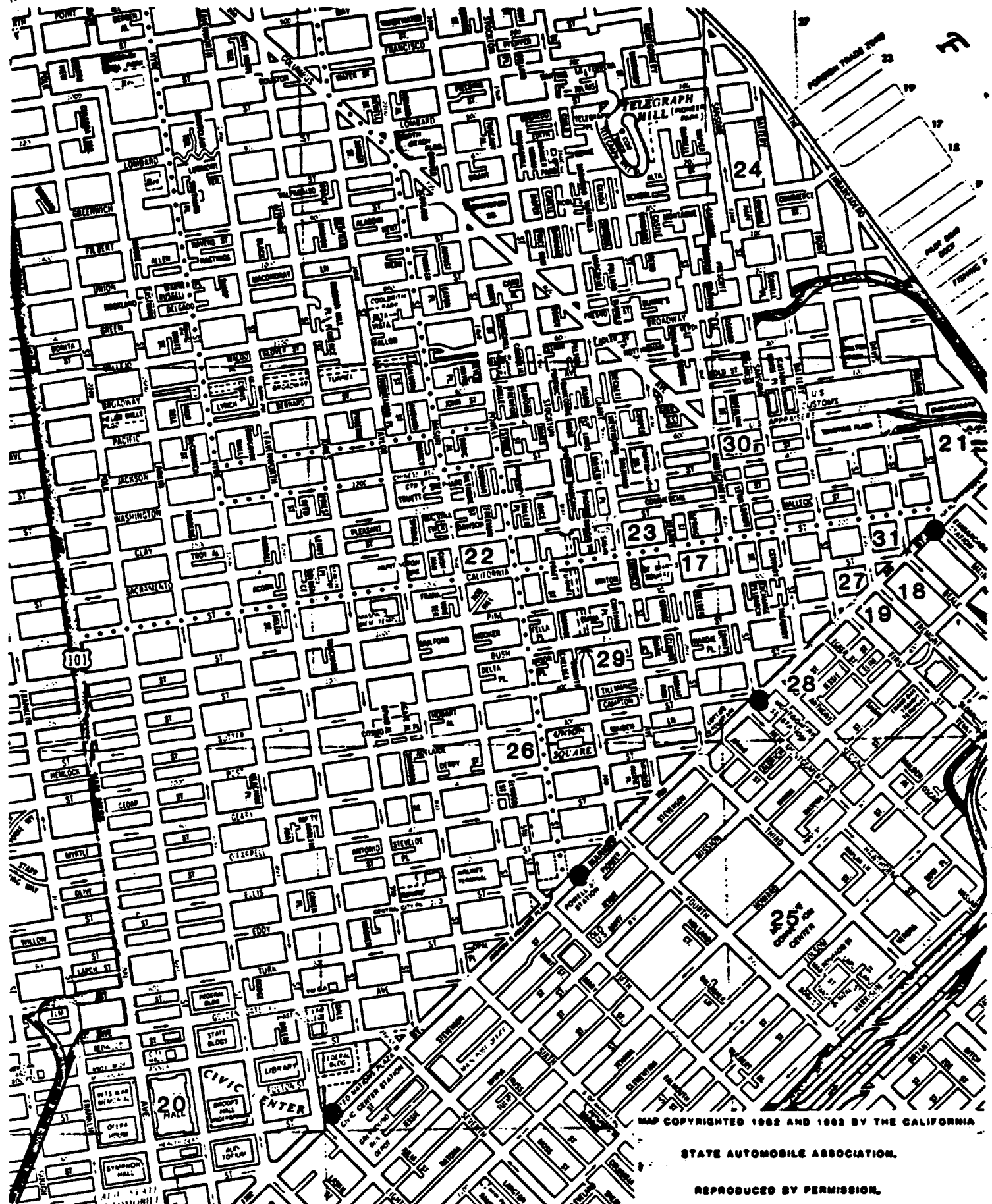
Location of selected structures in downtown San Francisco (numbers refer to Table 1).