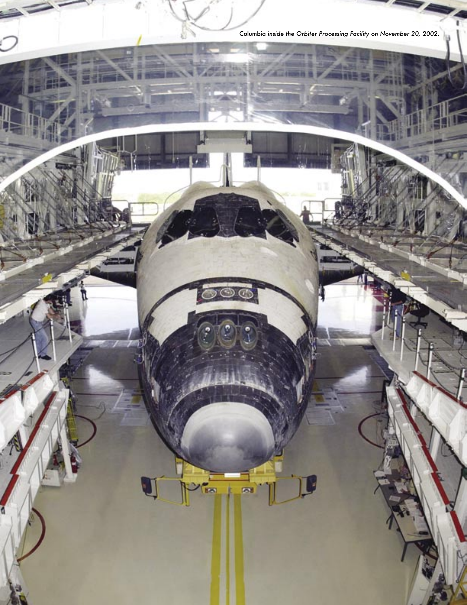
Columbia inside the Orbiter Processing Facility on November 20, 2002.