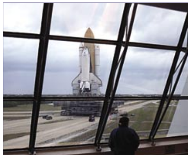
A view from inside the Launch Control Center as Columbia rolls out to Launch Complex 39-A on December 9, 2002.

These recommendations reflect both the Board's strong support for return to flight at the earliest date consistent with the overriding objective of safety, and the Board's conviction that operation of the Space Shuttle, and all human spaceflight, is a developmental activity with high inherent risks.