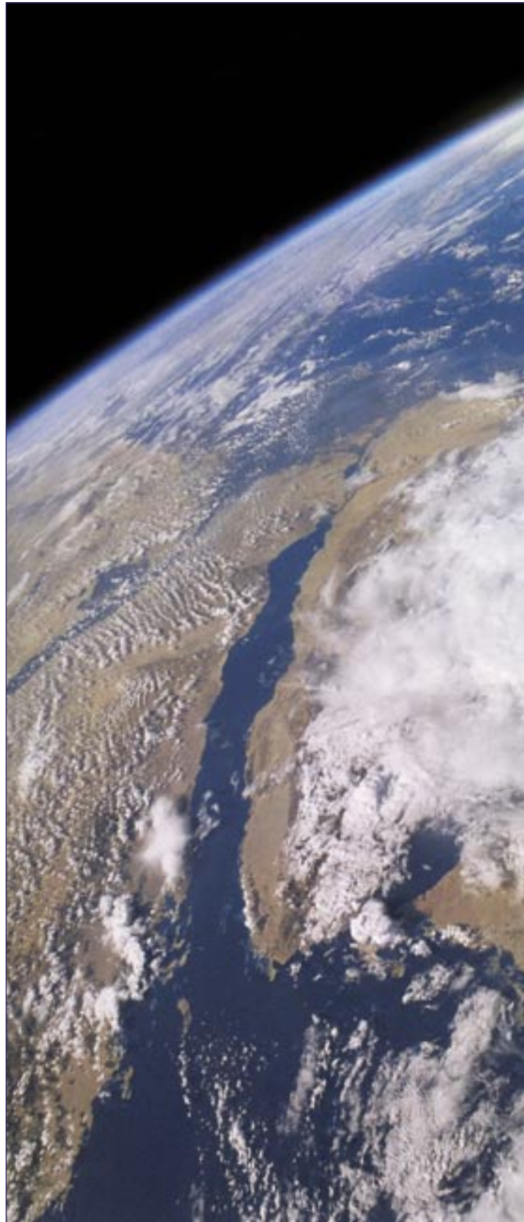
This Earth view of the Sinai Peninsula, Red Sea, Egypt, Nile River, and the Mediterranean was taken from Columbia during STS-107.

Part Four of the report by the Columbia Accident Investigation Board contains material relevant to this volume organized in appendices. Additional, stand-alone volumes will contain more reference, background, and analysis materials.