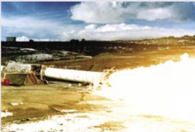
A Solid Rocket Booster (SRB) Demonstration Motor being tested near Brigham City, Utah.

Despite their power, the Space Shuttle Main Engines alone are not sufficient to boost the vehicle to orbit – in fact, they provide only 15 percent of the necessary thrust. Two Solid Rocket Boosters attached to the External Tank generate the remaining 85 percent. Together, these two 149-foot long motors produce over six million pounds of thrust. The largest solid propellant rockets ever flown, these motors use an aluminum powder fuel and ammonium perchlorate oxidizer in a binder that has the feel and consistency of a pencil eraser.