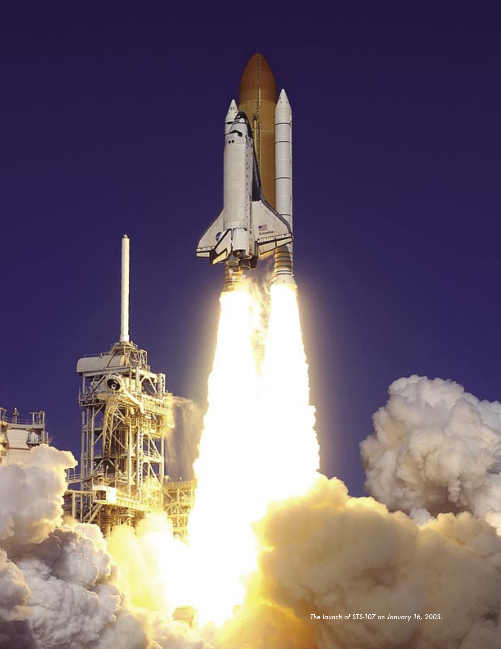
The launch of STS-107 on January 16, 2003.