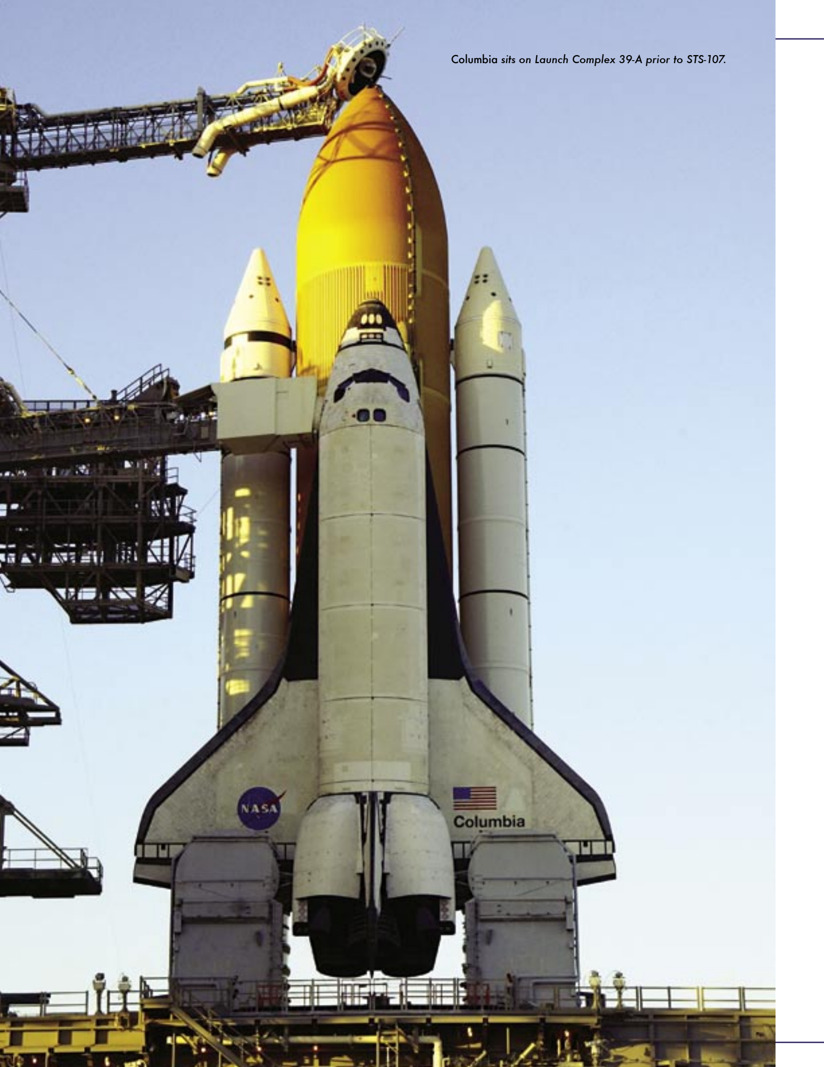
Columbia sits on Launch Complex 39-A prior to STS-107.