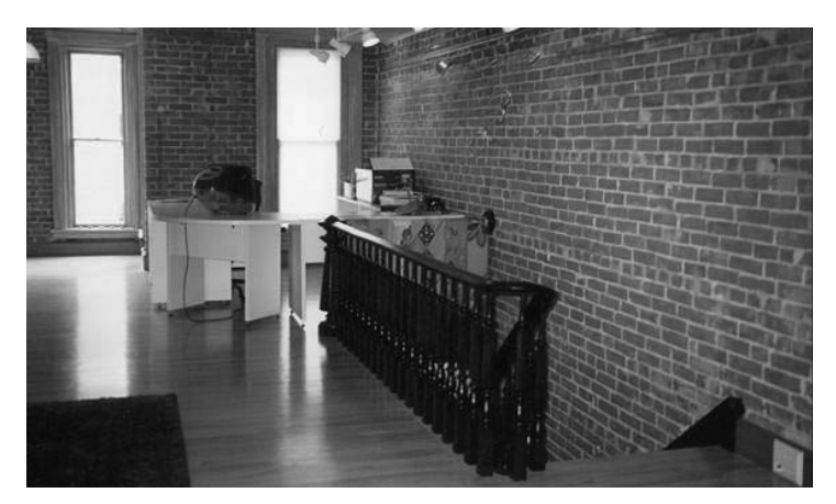
Loss of historic character: The original finished walls and all separations between rooms and hallway have been lost to create an open floor plan, causing this project not to qualify for tax credits.

To learn more about the Standards, visit the National Park Service website at <u>www.nps.gov/history/hps/tps/</u> or contact your State Historic Preservation Office (SHPO)