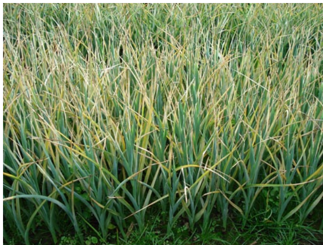
Dutch iris