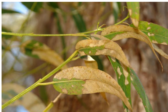
Eucalyptus globulus