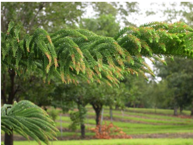
Norfolk Island pine

glycine ( Neonotonia wightii ) honohono grass ( Commelina diffusa ) a rush (unidentified)