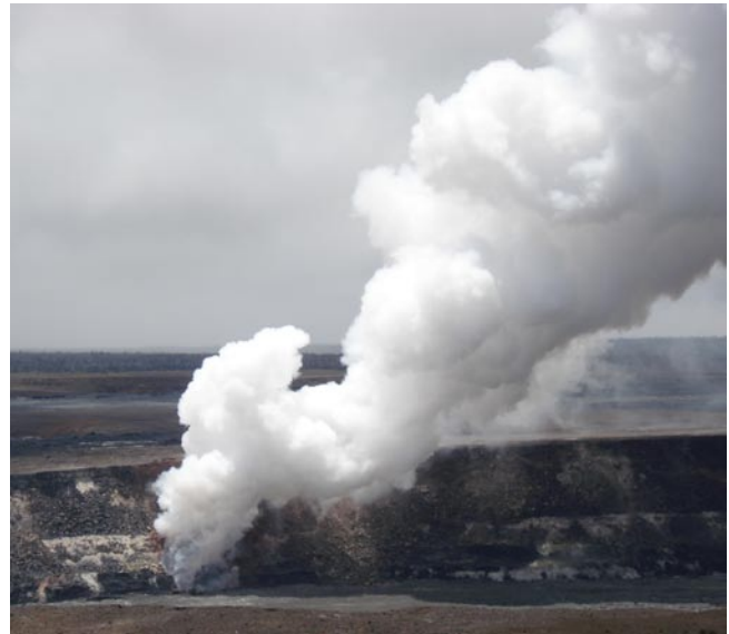
At Halema'uma'u in Hawai'i Volcanoes National Park, beginning on March 12, 2008, volcanic emissions emerged from a new vent and contained high concentrations of sulfur dioxide, some other gases, and volcanic ash.

Agricultural crops and other plants are subject to injury by exposure to the pollutants that emerge from Kīlauea, especially when they are present in high concentrations. Farmers and gardeners in the path of the pollutants (SO 2 and acid rain) have reported significant damage to plants caused by the northeasterly and southeasterly winds bringing SO 2 fumes from Pu'u 'Ō'ō and Halema'uma'u to downwind areas, such as those immediately surrounding Kīlauea, Pāhala, and Hawaiian Ocean View Estates.