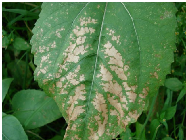
Sunflower Photos, this page (unless noted otherwise): K. Sewake