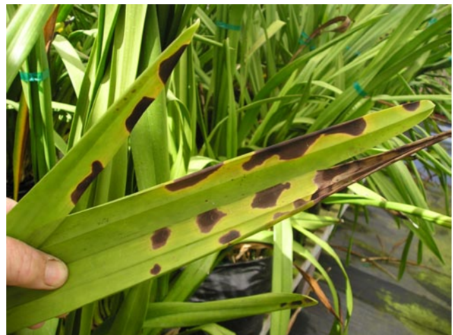
Cymbidium orchid