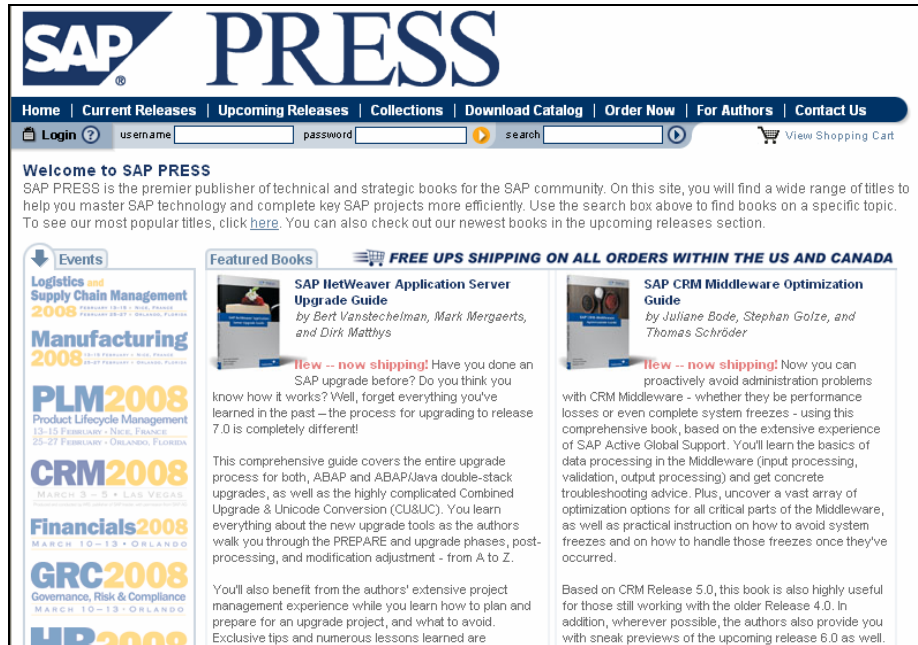
Figure 2. SAP PRESS Web Site