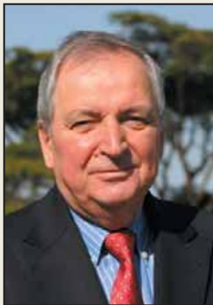
Klaus Töpfer, Ph.D. Executive Director United Nations Environment Programme

The images presented here show both the positive and negative impacts of human life on Earth. We hope also they will provide food for thought, as we seek ways to balance our use of the Earth’s resources with the need to sustain the environments that produce them and support the living systems that we value so highly.