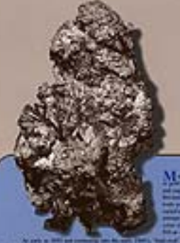
A specimen of a mineral, possibly a type of quartzite. The specimen is a dark, irregular rock. The specimen is a dark, irregular rock.

This is a specimen of a mineral, possibly a type of quartzite. It is found in the mountains of Colorado and is used for building. It is found in the mountains of Colorado and is used for building. It is found in the mountains of Colorado and is used for building.