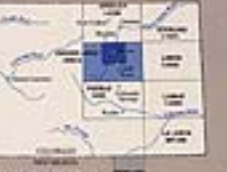
Inset map showing the location of the Denver 1° x 2° Quadrangle within the state of Colorado. The inset map shows the location of the Denver 1° x 2° Quadrangle within the state of Colorado.

This is a specimen of a mineral, possibly a type of quartzite. It is found in the mountains of Colorado and is used for building. It is found in the mountains of Colorado and is used for building. It is found in the mountains of Colorado and is used for building.