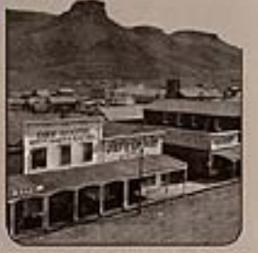
A large building, possibly a hotel or government building, in the town of Georgetown. The building was built in 1876 and was used for housing. The building was built in 1876 and was used for housing.

EXPLANATION This map shows the location of the Denver 1° x 2° Quadrangle within the state of Colorado. It includes a scale and a legend. It includes a scale and a legend. It includes a scale and a legend.