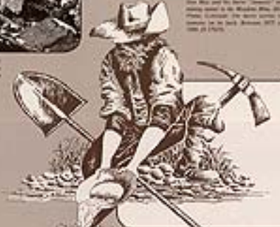
A prospector sitting on a rock, holding a pickaxe and a shovel. The illustration shows a prospector sitting on a rock, holding a pickaxe and a shovel. The illustration shows a prospector sitting on a rock, holding a pickaxe and a shovel.