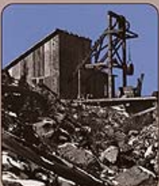
Industrial building at the site of the Colorado Central Railroad. The building was built in 1876 and was used for processing coal. The building was built in 1876 and was used for processing coal.

THE GOLD RUSH The gold rush in Colorado began in 1859 when James W. Wicks discovered gold in the area of Leadville. The gold rush in Colorado began in 1859 when James W. Wicks discovered gold in the area of Leadville. The gold rush in Colorado began in 1859 when James W. Wicks discovered gold in the area of Leadville. The gold rush in Colorado began in 1859 when James W. Wicks discovered gold in the area of Leadville.