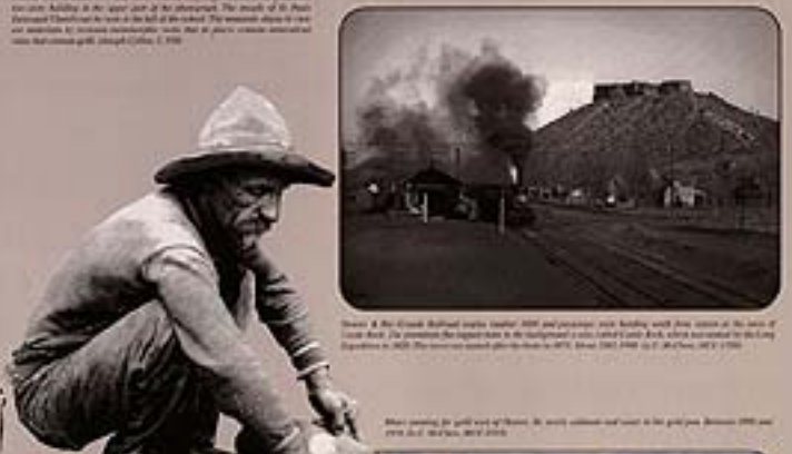
Man working the gold vein of Silver. He is using a pickaxe and shovel to dig for gold. The photograph was taken in 1876 and shows the man working in the field. The photograph was taken in 1876 and shows the man working in the field.

Scale of the Enlarged Map 1:50,000 1 inch = 1 mile 1 centimeter = 100 meters