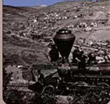
Remnants of the Colorado Central Railroad and part of the railway used to transport coal from the mines to the city of Denver. The railway was built in 1876 and was used to transport coal from the mines to the city of Denver. The railway was built in 1876 and was used to transport coal from the mines to the city of Denver.