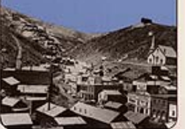
Georgetown, Colorado, in 1876. The photograph shows the town of Georgetown, Colorado, in 1876. The photograph shows the town of Georgetown, Colorado, in 1876.