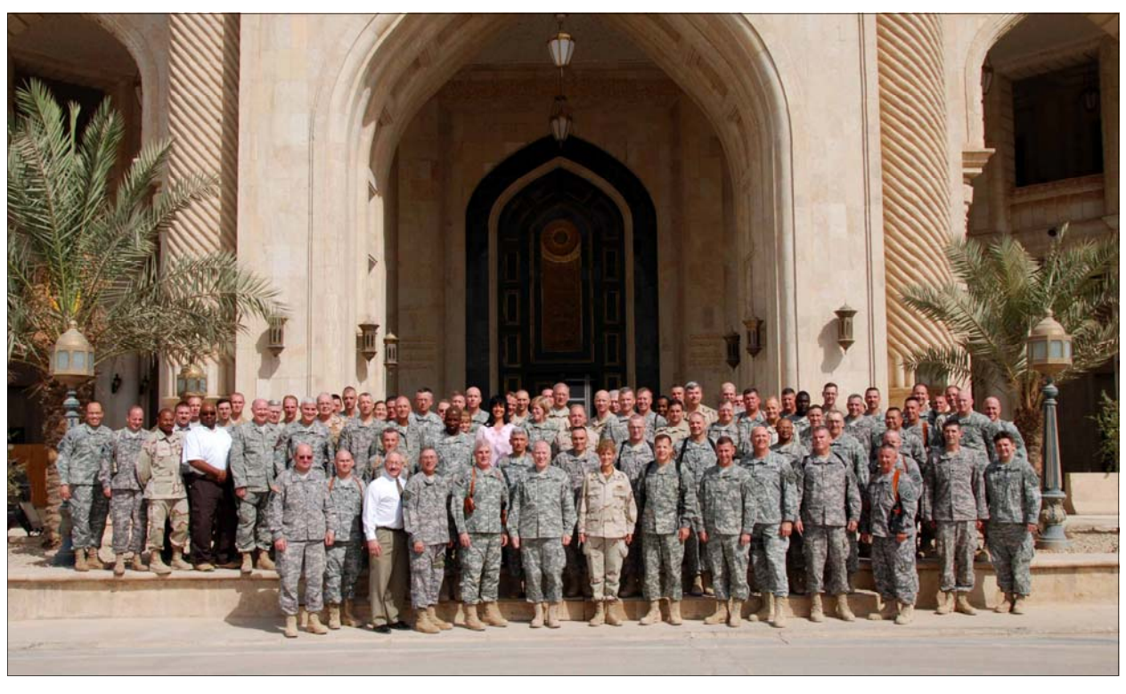
More than 100 participants of the Engineer Summit at al Faw Palace in Baghdad focused on the theme of "Engineers in Support of Division Operations."