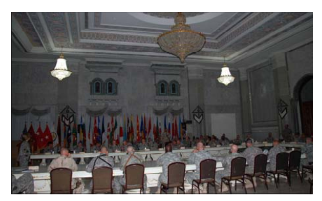
The GRD-hosted Engineer Summit sessions in al Faw Palace discussed "Engineers in Support of Division Operations."