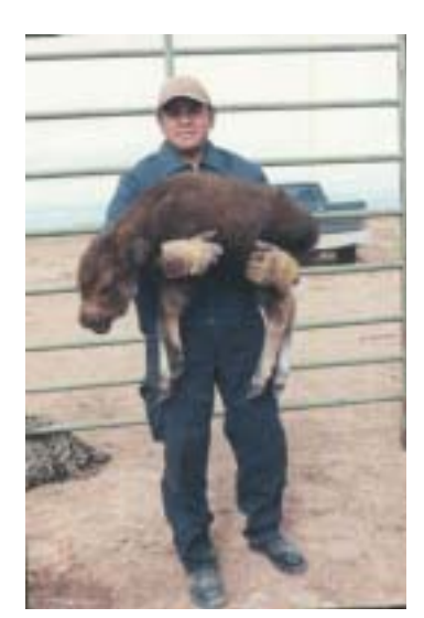
Ute Indian Buffalo roundup at buffalo (bison) roundup

The Utah FWMAO works with our tribal partners to better manage their fish, wildlife, and habitat resources on 4.5 million acres of Tribal land. This includes managing fish and wildlife resources, restoring native species, recovering threatened and endangered species. In addition, the station provides hands-on learning experiences for Tribal members interested in pursuing fish and wildlife careers.