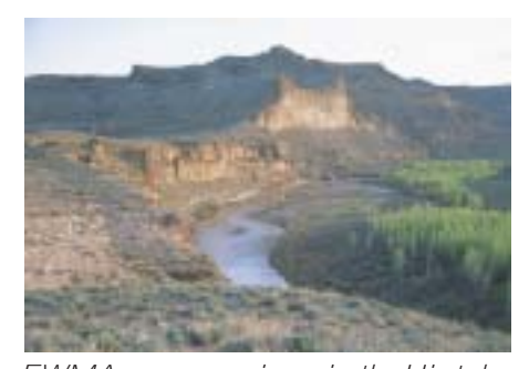
FWMA manages rivers in the Uintah Basin, Utah.

The U.S. Fish and Wildlife Service's (Service) Fish and Wildlife Management Assistance (FWMA) program is comprised of 64 field stations nationwide. There are 9 Mountain-Prairie Region FWMA offices, located in Colorado, Montana, North Dakota, South Dakota, Utah & Wyoming.