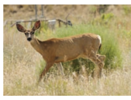
A mule deer at the Rocky Mountain Arsenal Refuge

The independent analysis was undertaken to fulfill the Program Assessment Rating Tool (PART)—part of the President's Management Agenda. It was mandated by the Office of Management and Budget (OMB). The full text of the report as well as its executive summary is available at: <www.fws. gov/refuges/policyMakers/ independentEval.html>.