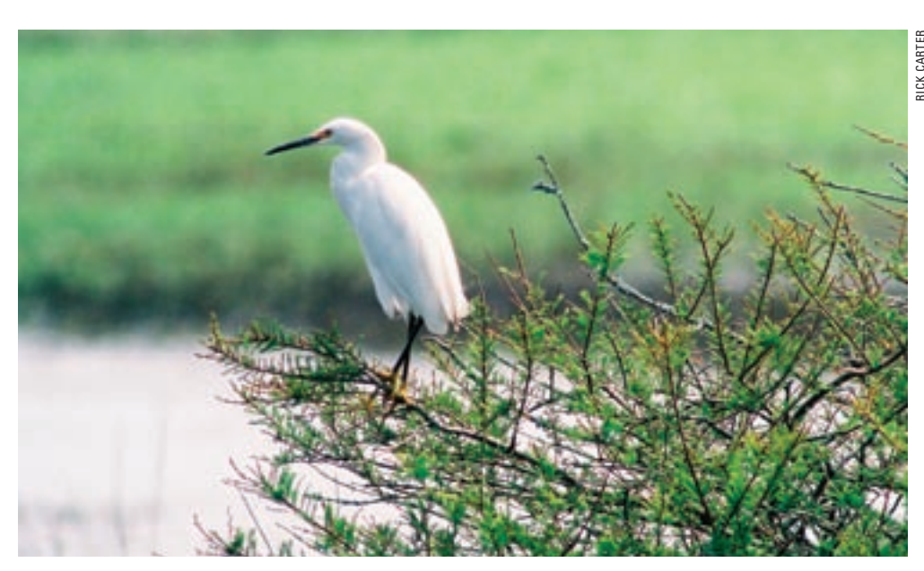
Egrets will have a new advocate with the formation of the Friends of Pocosin Lakes National Wildlife Refuge in North Carolina.

Friends of the Savannah Coastal Wildlife Refuge in Georgia and South Carolina will be supporting seven refuges, including Pinckney Island, Savannah, Harris Neck, Tybee, Blackbird Island, Wassaw