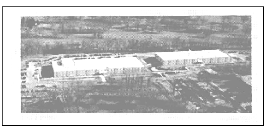
Figure 2. Army Materiel Command Modular Headquarters Building.

Wrong Appropriation. For 15 of the 75 purchases, DoD organizations used the wrong appropriation to fund the requirement. For example, the Program Manager, Defense Communications and Army Transmission Systems (PM/DCATS), sent 18 MIPRs citing O&M funds valued at approximately $44 million, to GSA for the Army Materiel Command Headquarter Relocation purchase. For that purchase, GSA contracted for the construction of two modular two-story office buildings totaling about 230,000 square feet at Fort Belvoir to serve as the new Headquarters of the Army Materiel Command and offices for about 1,400 civilian and military personnel. See figure 2 for a picture of the Headquarters.