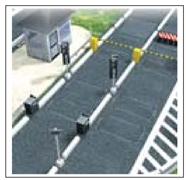
Figure 1. Unmanned Smart Gate with vehicle barrier.

In addition, in August 2003, the Air Force Air and Space Operations approved and sent $351 million of Global War on Terrorism funds to the Electronic Systems Center Force Protection Command and Control System Program Office (ESC/FD) to support force protection operations. ESC/FD sent three MIPRs, valued at $171 million, with FY 2003 O&M funds, to GSA to purchase unmanned "smart gates" on five planned contracts to achieve this objective. See figure 1 for a picture of the smart gate.