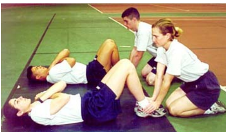
Figure 3 Start/Finish Position

Scoring: Record the number of properly executed sit-ups performed in a two-minute period.