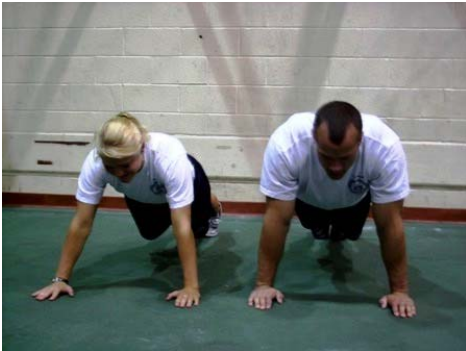
Figure 1 Proper Up Position

Scoring: Record the total number of properly executed push-ups. If the candidate is able to stay with cadence for two minutes, the maximum raw score is 60.