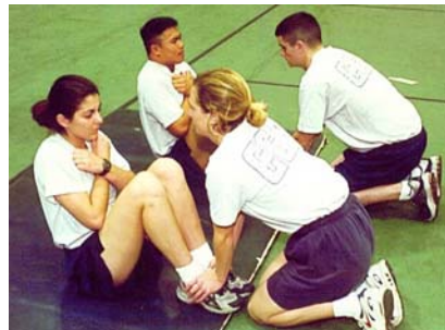
Figure 4 Proper Sit-Up Position