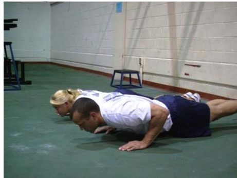
Figure 2 Proper Down Position