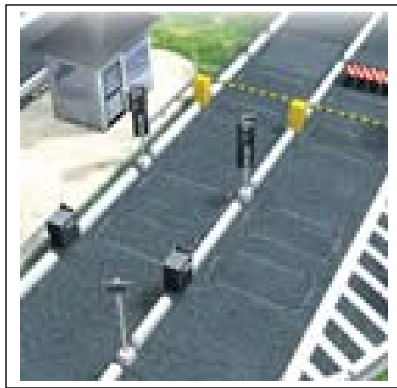
Figure 1. Unmanned Smart Gate with vehicle barrier.

In addition, in August 2003, the Air Force Air and Space Operations approved and sent $351 million of Global War on Terrorism funds to the Electronic Systems Center Force Protection Command and Control System Program Office (ESC/FD) to support force protection operations. ESC/FD sent three MIPRs, valued at $171 million, with FY 2003 O&M funds, to GSA to purchase unmanned “smart gates” on five planned contracts to achieve this objective. See figure 1 for a picture of the smart gate.