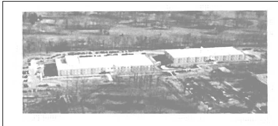
Figure 2. Army Materiel Command Modular Headquarters Building.

Wrong Appropriation. For 15 of the 75 purchases, DoD organizations used the wrong appropriation to fund the requirement. For example, the Program Manager, Defense Communications and Army Transmission Systems (PM/DCATS), sent 18 MIPRs citing O&M funds valued at approximately $44 million, to GSA for the Army Materiel Command Headquarter Relocation purchase. For that purchase, GSA contracted for the construction of two modular two-story office buildings totaling about 230,000 square feet at Fort Belvoir to serve as the new Headquarters of the Army Materiel Command and offices for about 1,400 civilian and military personnel. See figure 2 for a picture of the Headquarters.