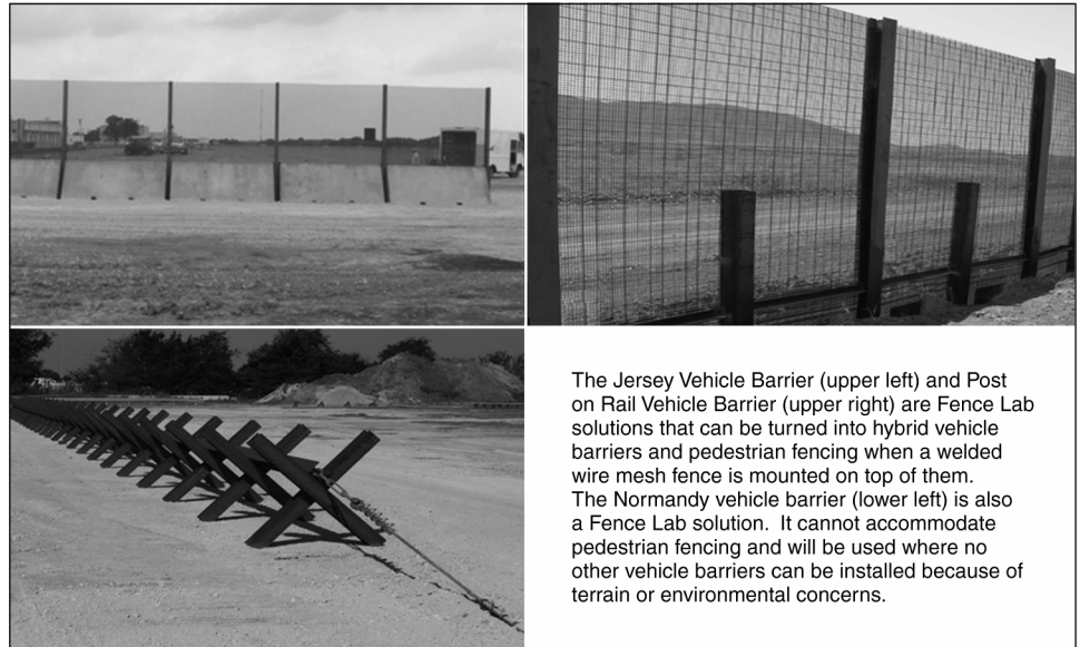
Figure 6: Vehicle Barriers and Fencing Developed by Fence Lab That Meet Performance Requirements and Are Included in SBInet’s “Toolbox” of Approved Fences and Barriers.

Source: GAO analysis of CBP data; photos by CBP.