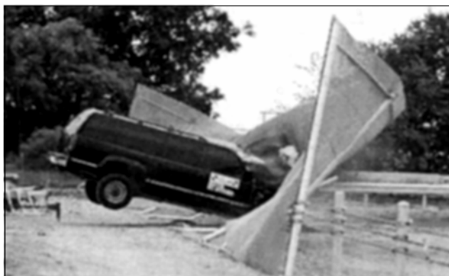
Figure 5: Fence Lab crash testing conducted in May 2007

“toolkit” of approved fences and barriers, 21 and plans to deploy solutions from this toolkit for all remaining vehicle barriers and for 202 of 225 miles of remaining fencing. Further, CBP officials anticipate that deploying these solutions will reduce costs because cost-effectiveness was a criterion for their inclusion in the toolkit. SBI net officials also told us that widely deploying a select set of vehicle barriers and fences will lower costs through enabling it to make bulk purchases of construction and maintenance materials.