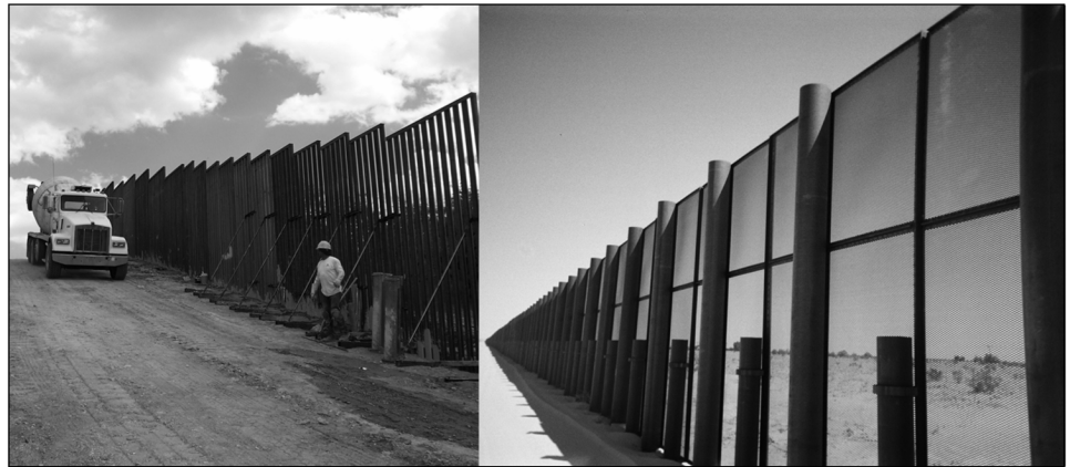
Figure 4: At Left, SBInet Fencing Being Deployed at Sasabe, Arizona; at Right, SBInet Fencing Deployed at Yuma, Arizona