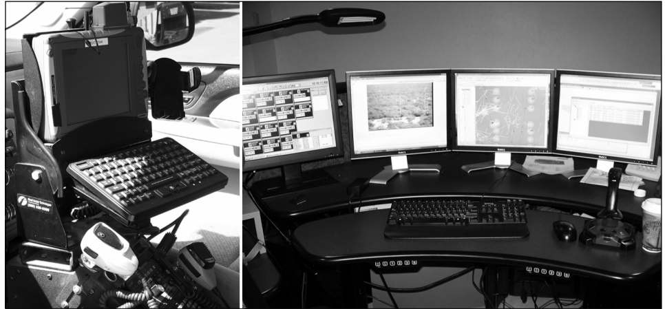
Figure 3: At Left, Mounted Laptop Installed in Border Patrol Vehicle; at Right, Project 28 Command and Control Center