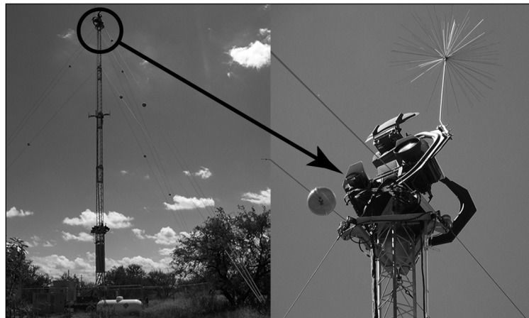
Figure 2: Project 28 Mobile Sensor Tower Deployed in Tucson Sector

their activities, and CBP was to begin its operational test and evaluation phase. Boeing delivered and deployed the individual technology components of Project 28 on schedule. 12 Nevertheless, CBP and Boeing officials reported that Boeing has been unable to effectively integrate the information collected from several of the newly deployed technology components, such as sensor towers, cameras, radars, and unattended ground sensors. Among several technical problems reported were that it was taking too long for radar information to display in command centers and newly deployed radars were being activated by rain, making the system unusable. In August 2007, CBP officially notified Boeing that it would not accept Project 28 until these and other problems were corrected. In September 2007, CBP officials told us that Boeing was making progress in correcting the system integration problems; however, CBP was unable to provide us with a specific date when Boeing would complete the corrections necessary to make Project 28 operational. See figures 2 and 3 below for photographs of SBI net technology along the southwest border.