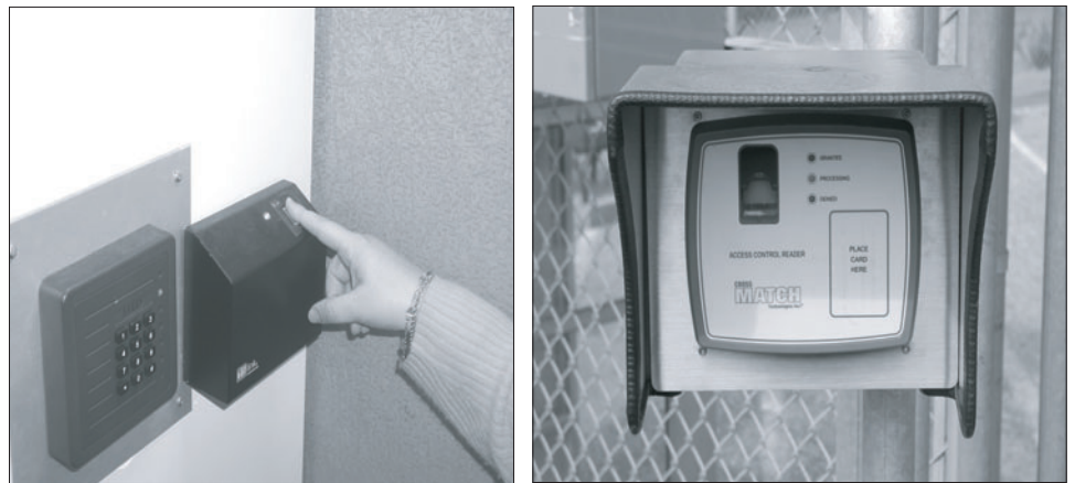
Figure 3: Fingerprint Based Biometric Card Readers Used during TWIC Testing

and others had problems effectively interfacing card readers with existing facility access control systems. Figure 3 provides an example of biometric card readers used during testing of the TWIC program.