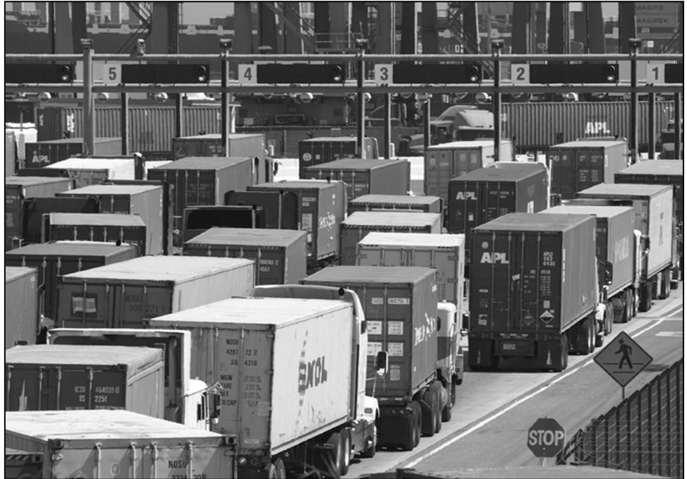
Figure 4: Trucks Carrying Cargo through an Access Control Point at a Large Maritime Facility