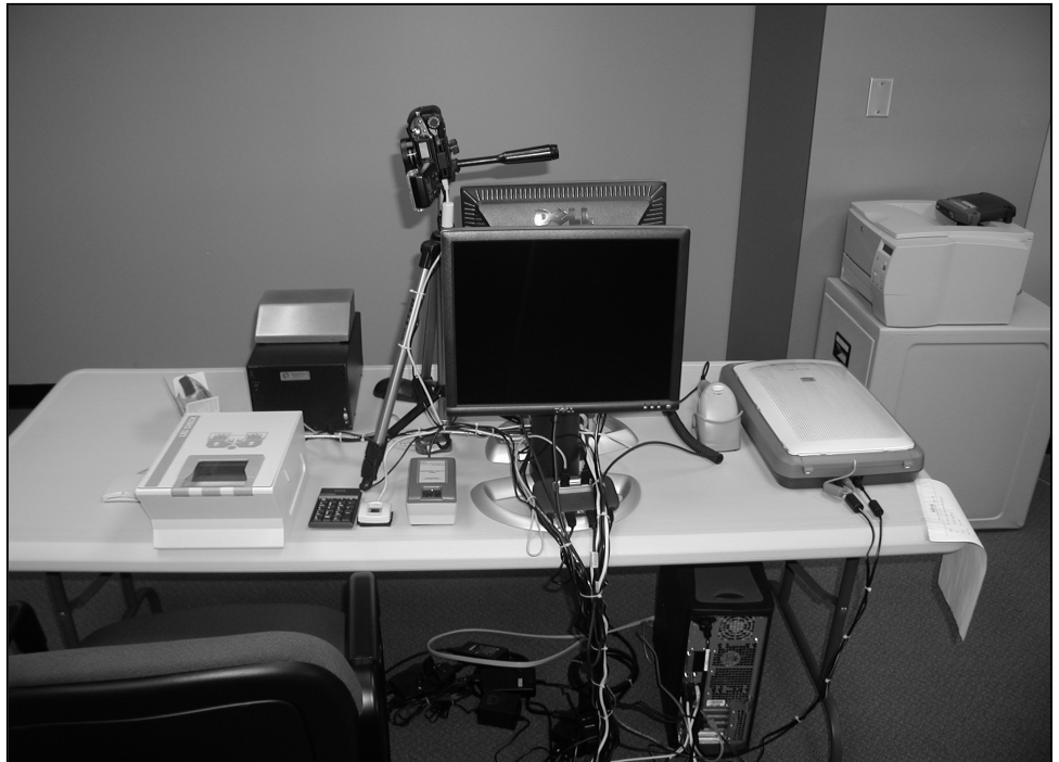
Figure 2: TWIC Enrollment Station Used during Testing