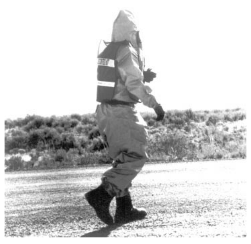
Figure 2: Individual Wearing a Personal Protective Suit During a CSEPP Exercise