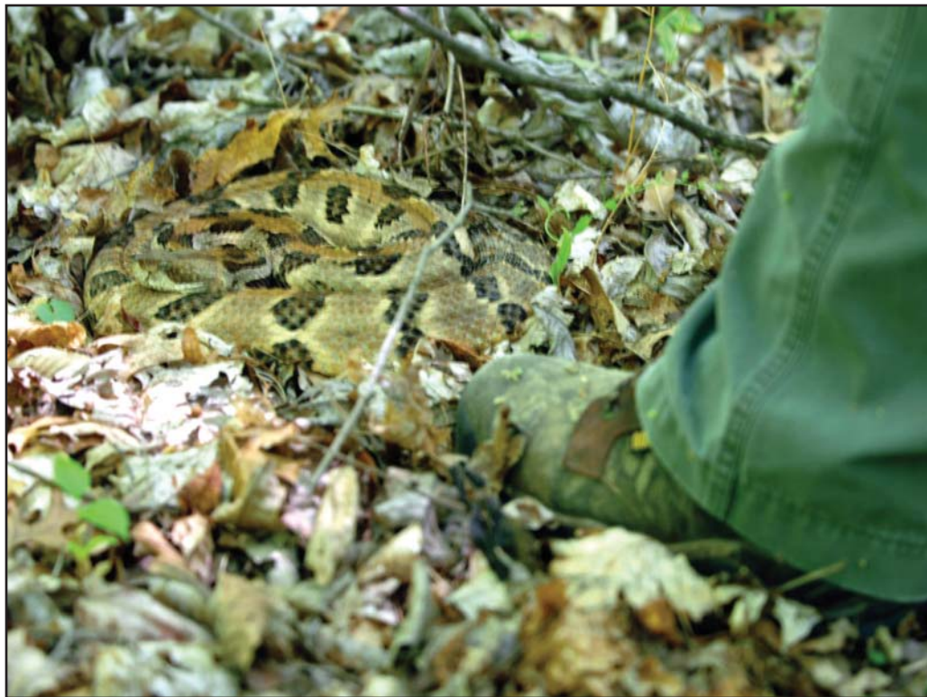
'Peaches' relies on camouflage to avoid detection. Bryan marks her location with a GPS.

known to den communally. In some areas, Timber Rattlesnake populations have dropped to critically low levels as a result of dens being abused and used as activity centers from which to collect snakes.