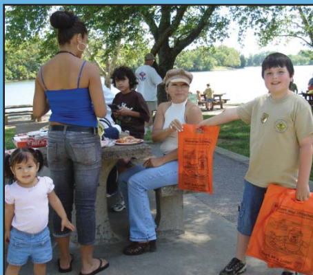
A Boy Scout delivers another packet.

ing public about water safety and the importance of wearing properly fitting life jackets when near the water. The Scouts handed out documentation about the proper sizing and fit of life jackets and gave informative (See Scouts, page 12)