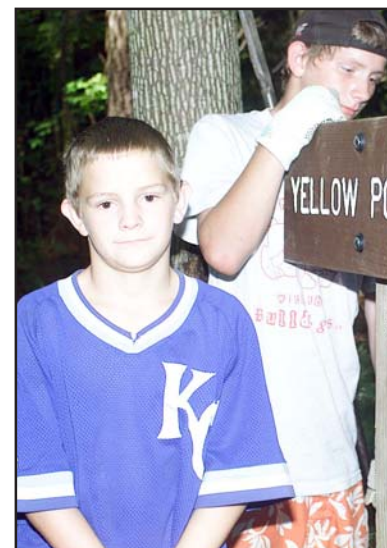
Young volunteers help add tree Old Hickory in 2003.