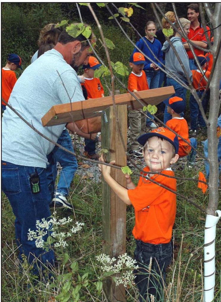
Volunteers help spruce up the Buffalo Valley Nature Trail last year for National Public Lands Day.

The staff at Cordell Hull will invite volunteers to take part in a cleanup of the shoreline on Sept. 18. Pickup stations will be set up at Roaring River Park in Gainesboro and at Defeated Creek Park near Carthage. Volunteers will be provided with