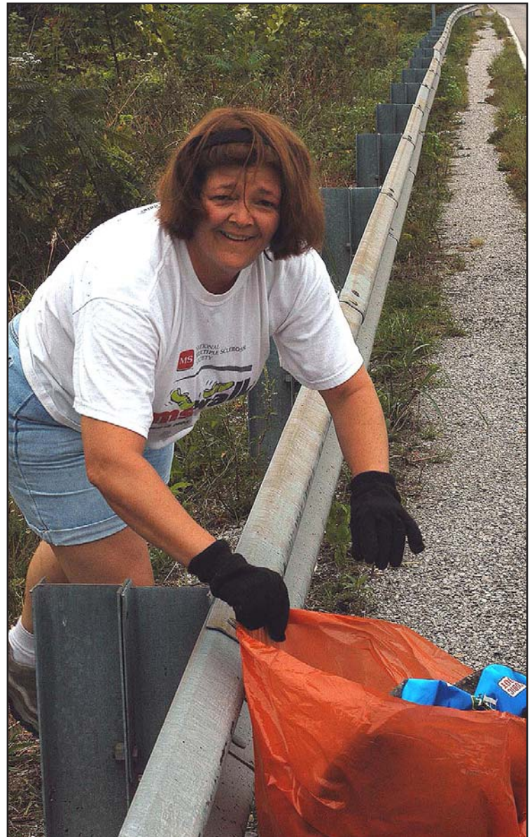
A volunteer picks up garbage in 2003 at Cordell Hull Lake near the Defeated Creek Campground.

The staff plans to host approximately 100 volunteers beginning at 9 a.m. Sept. 18 at the Hilltop Picnic Shelter.