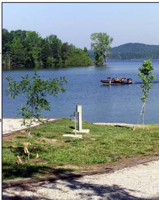
Young deciduous trees now dot the shoreline at Lillydale, replacing pines destroyed by beetles.

The beetles, part of a pine tree epidemic that swept through the southeastern states, ravaged the mature, non-native loblolly pine forests planted around Dale Hollow Lake approximately 50 years ago for conservation measures and erosion protection. The pine beetles have always been present, however, the severe outbreak in 2000 was due to several warm winters together