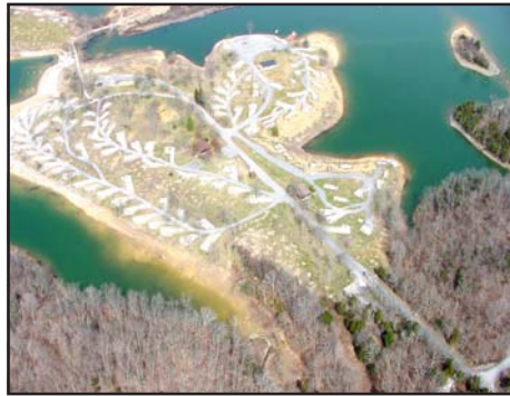
Aerial view of Lillydale Campground.

The popular campground owes much to the Dale Hollow chapter of the Wild Turkey Federation and the Friends of Dale Hollow Lake, Incorporated, which partnered to help reforest the campground in 2001 and 2002. The Boy Scouts of America, Upper Cumberland District, volunteered many hours in planting trees, while students from