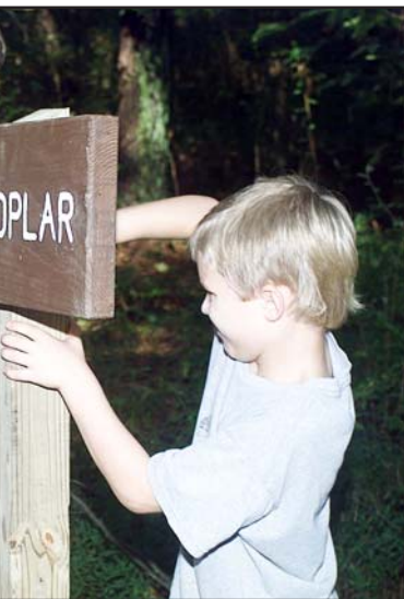
placards to the nature trail at

This year's cleanup will be held 9 a.m. - noon, rain or shine. Sign-in and garbage pick-up sites will be located at the Floating Mill and Ragland Bottom Recreation Areas.