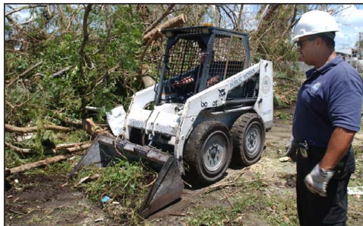
A Bobcat collects debris scattered by Hurricane Charley, a procedure that is due to be repeated many times as a result of damage wrought by Hurricane Frances.