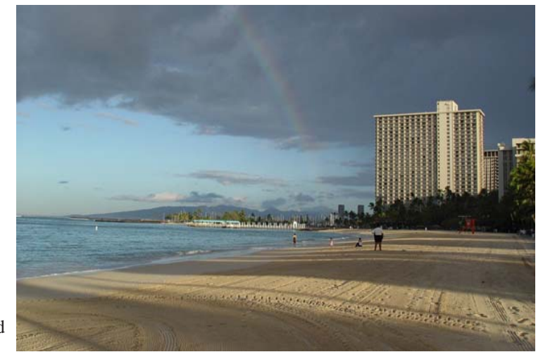
The beach at Waikiki, adorned by an afternoon rainbow, is framed by one of the Hale Koa towers.

Germany's highest peak. Garmisch is famous for hosting the 1936 Winter Olympic Games. Bavarian tradition and old-world charm make this a picturesque vacation destination. Winter activities include skiing, snowboarding and cross-country skiing. When the snow melts, their 9-hole golf course provides a challenge for any golfer. Summer activities include kayaking, white water rafting, mountain biking and hiking. Visit Garmisch at http://www.afrc europe.com/ . The Armed Forces Recreation Center site logo states that "Morale, Welfare and Recreation is for all of your life."