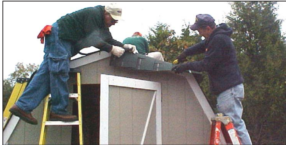
Three EAGLE class members install roofing shingles on a utility building Oct. 17 while working on the Habitat for Humanity project.