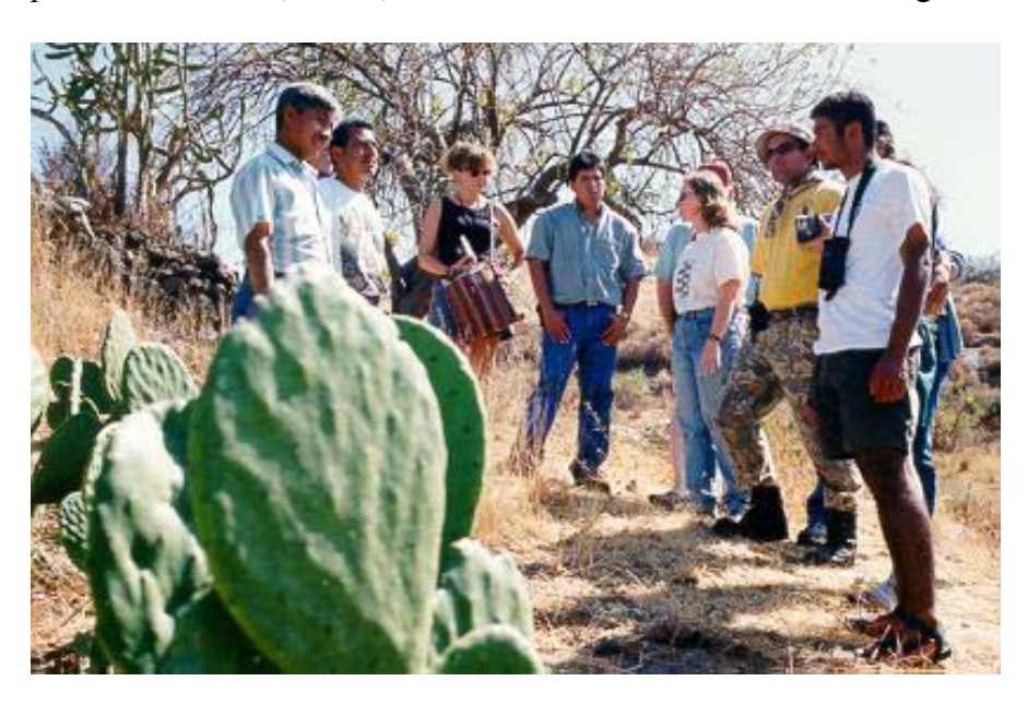
En route to Hierve el Agua, guides toured a textile factory at Teotitlán del Valle, learning of the cochinilla bug that provides the red dye in naturally-coloured fabrics.

The project strengthened communities through sustainable tourism development by involving guides from the three countries in sharing information and discussing the challenges, opportunities, needs and processes required to further develop this industry. Communities in these areas gained an international perspective about ecotour delivery, and have become more acutely aware of the value of sustainable tourism, which extends beyond local employment to provide economic, social, cultural and environmental well-being.