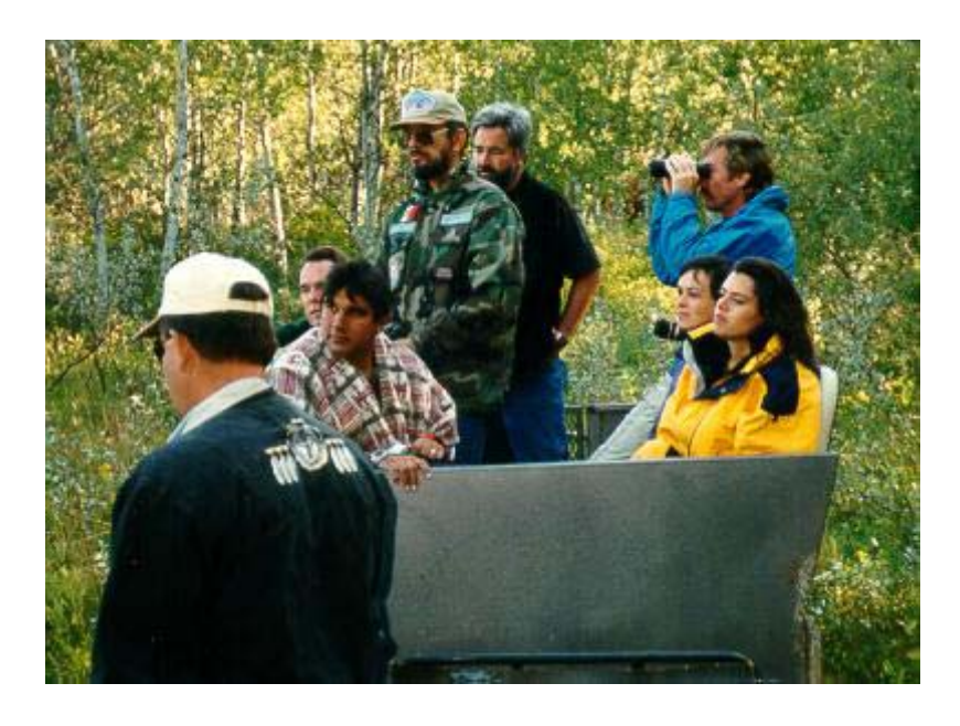
Guides toured the Quill Lakes area while in Saskatchewan last August.