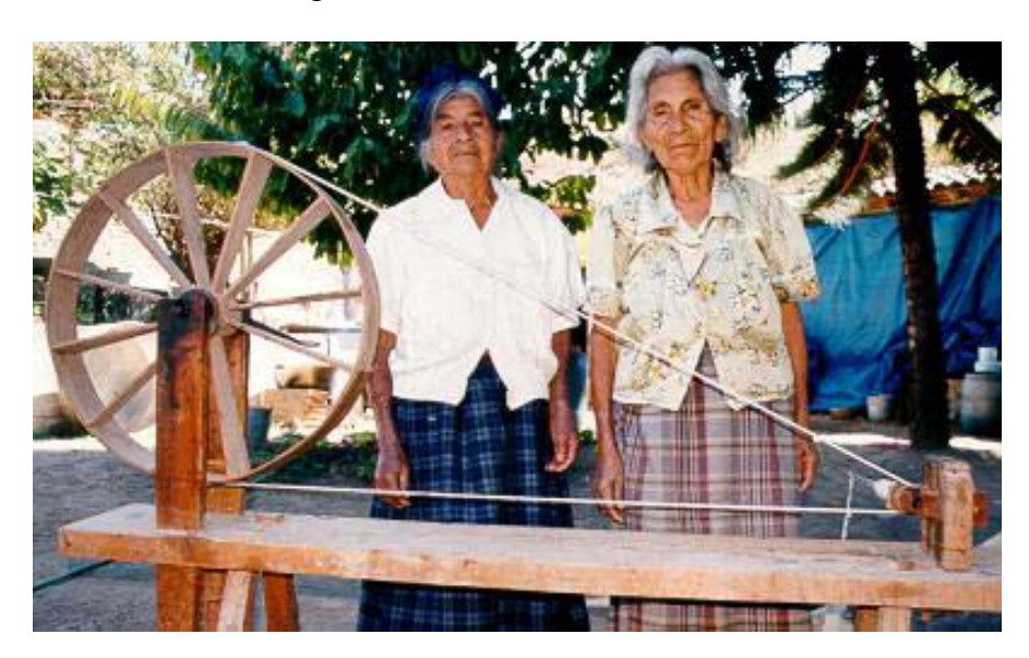
Ecotourism enhances community pride. Photo at a textile factory in Teotitlán del Valle, Oaxaca.

Guides firmly believe that without the understanding and cooperation of their communities, their industry would fail. Tantamount is the provision of benefits—social, economic, cultural, environmental—that accrue to the community that supports ecotourism. Comments included various techniques to promote community involvement, and how, "outsiders who visit and praise the area and its amenities" are the quickest catalysts to changing local attitudes, behaviour and a community's acceptance of ecotourism. The "balance in delivery" is delicate; it weighs the benefits to the community with low impact to the environment. An additional caution was noted as one guide stated, "We must be careful not to place so much burden on local people—perhaps we place too much already—as not all communities have expertise and experience on their own to develop in sustainable fashion."