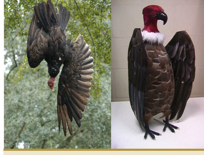
Taxidermic (left) and artificial vulture effigies are used to disperse vultures from their roosts.

Research conducted by NWRC scientists has demonstrated that proper installation of a vulture effigy almost always causes abandonment of the roost within 3 to 5 days. The effigy is either a taxidermic mount of a vulture or a commercially available artificial likeness.