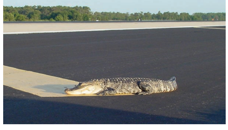
Figure 2 —Birds are not the only wildlife hazard to aviation. Although not as common, collisions with other wildlife can be equally life threatening.

Wildlife strikes cause more than 550,000 hours of aircraft downtime and cost U.S. civil aviation in excess of $500 million every year. Birds account for roughly 97 percent of all aircraft collisions with wildlife; the remainder is attributed to large mammals (e.g., deer and coyotes) and reptiles (e.g., alligators). More than 700 deer collisions were reported in the United States from 1990 through 2006. These losses do not include the costs from wildlife strikes to U.S. military aircraft, which are estimated at well over $100 million per year.