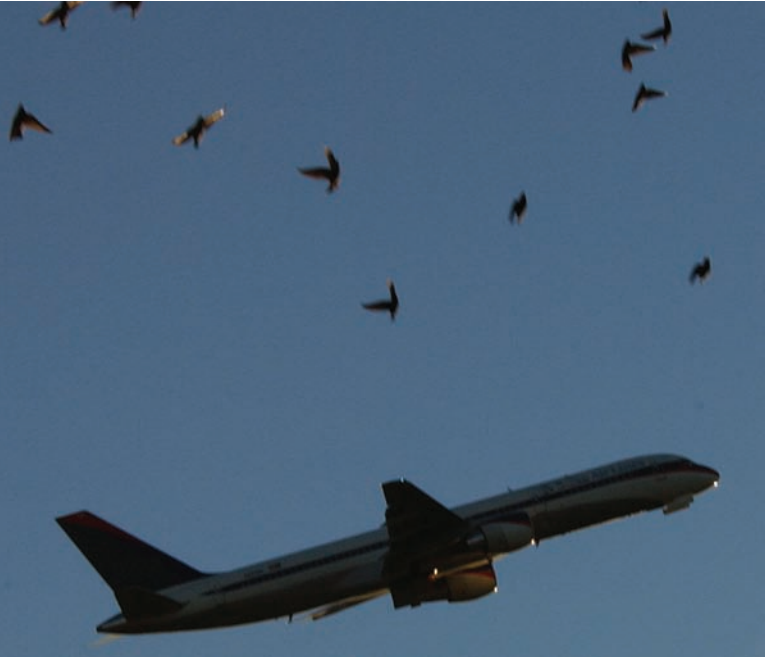
Figure 4 —With wildlife populations increasing and over 29 million commercial aircraft departures in the United States each year, more attention must be paid to reducing collisions between aircraft and wildlife.