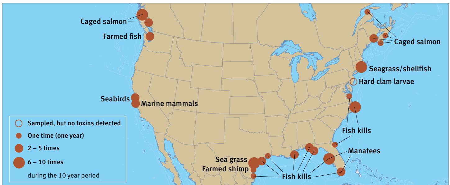
Sites in which algal blooms have led to animal and plant deaths in North American coastal waters (1993–2002)