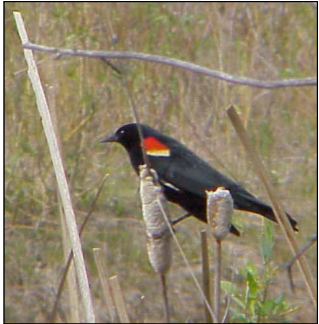
Red-winged blackbirds, like this one, are among the more than 200 bird and mammal species at Barber Pool.

Through this combined master planning effort, the Friends of BPCA now has a plan of action to support their goals to protect the resource and provide educational and recreational opportunities, as well as any future management needs.