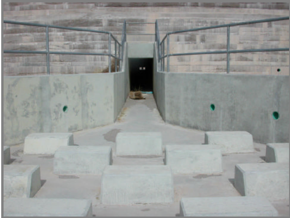
Photo 6. Blue Diamond Detention Basin . Downstream end of outlet works and dissipator blocks.