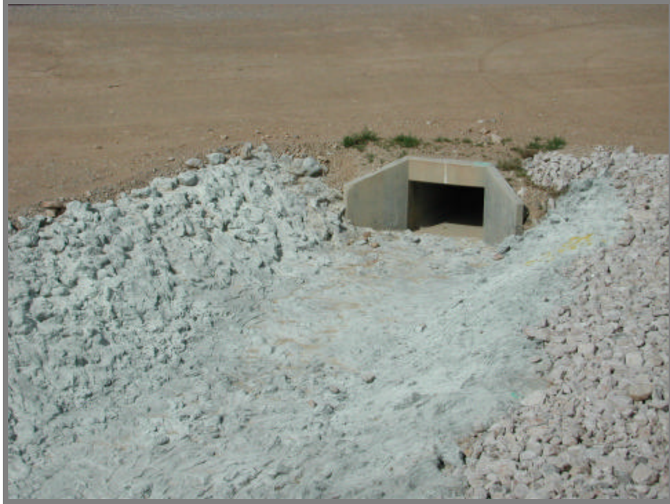
Photo 8. Blue Diamond Detention Basin . Riprap collector channel from a box culvert located upstream of the entrance of the basin bypass conduit.