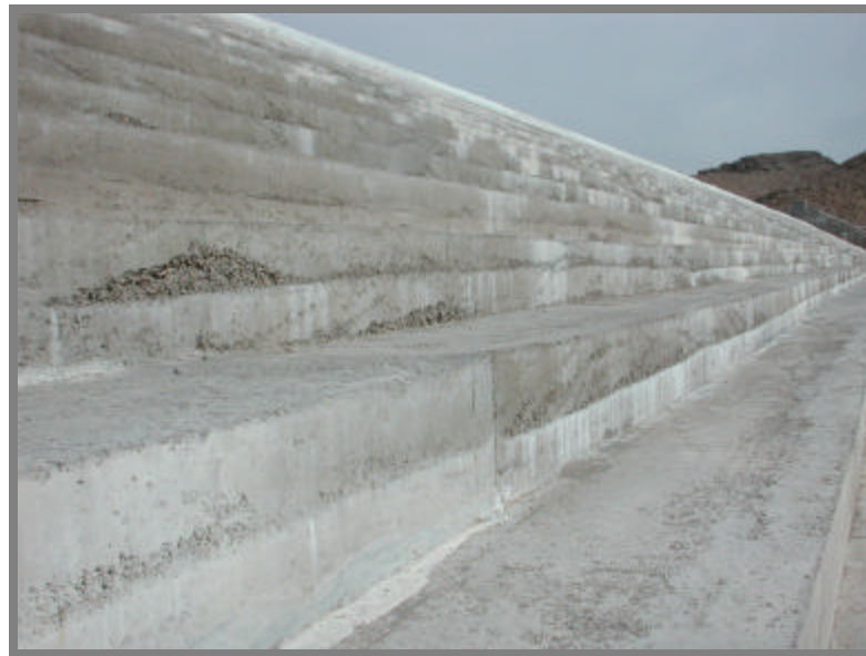
Photo 2. Blue Diamond Detention Basin . Spillway steps.