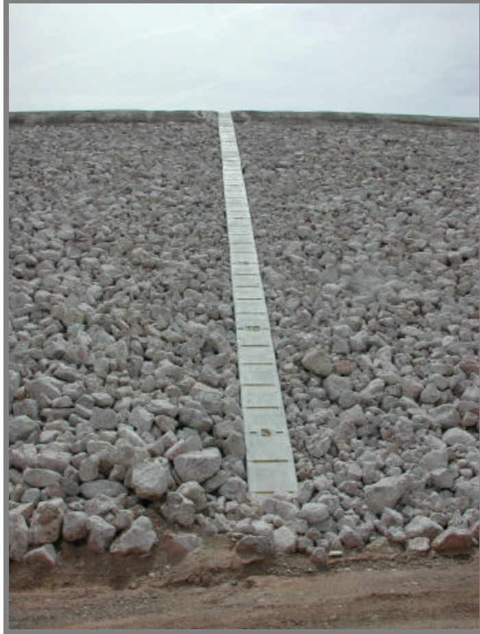
Photo 11. Blue Diamond Detention Basin . Basin depth gage.