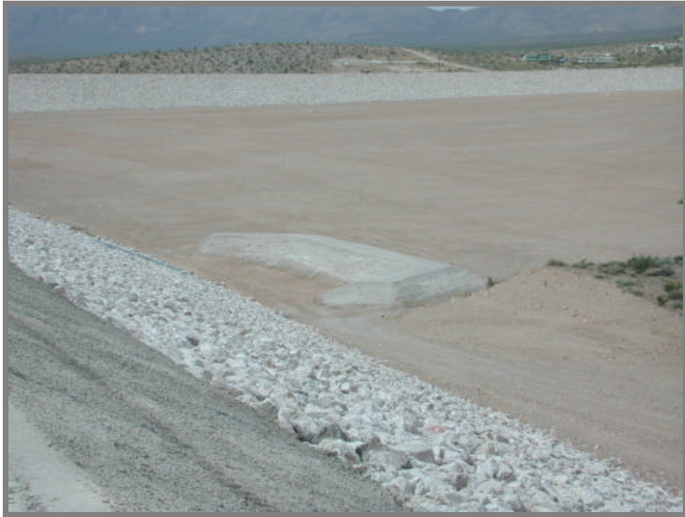
Photo 3. Blue Diamond Detention Basin . Sediment berm.