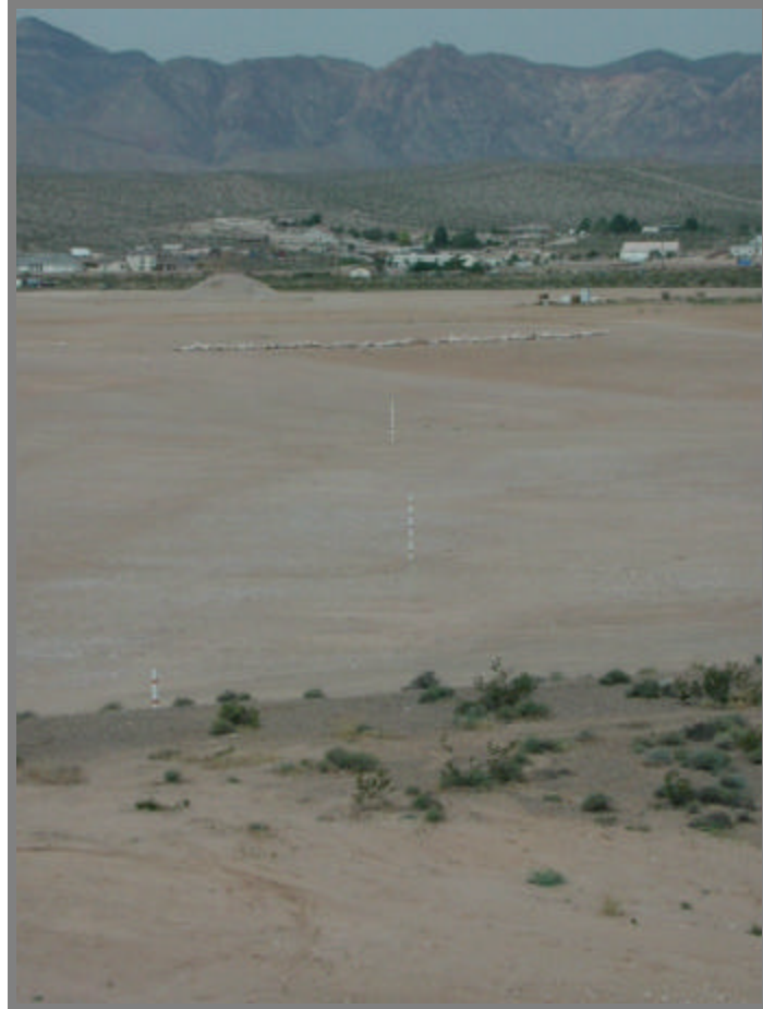
Photo 14. Blue Diamond Detention Basin . Sediment staff gages.