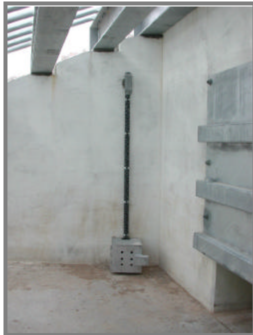
Photo 13. Blue Diamond Detention Basin . Water surface sensor.