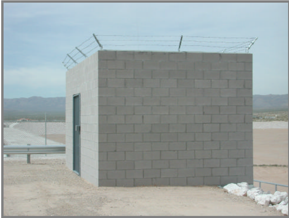
Photo 12. Blue Diamond Detention Basin . Hydrologic instrumentation vault.