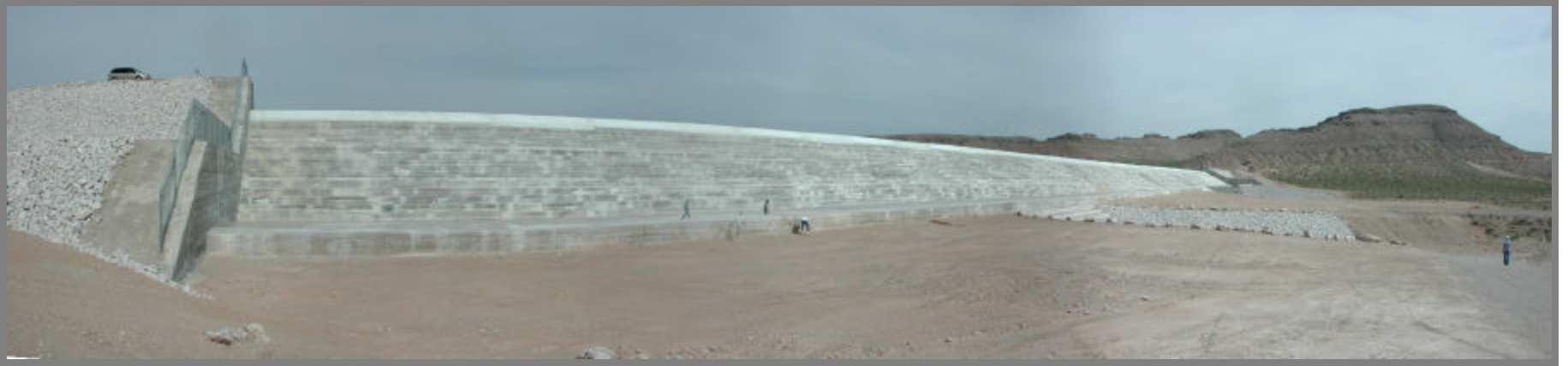
Photo 1. Blue Diamond Detention Basin . Spillway structure.