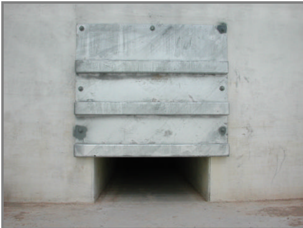
Photo 5. Blue Diamond Detention Basin . Upstream end of outlet works, showing intake structure constrictor plate.