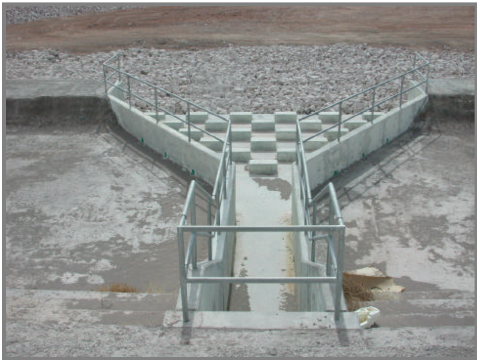
Photo 7. Blue Diamond Detention Basin . Looking downstream of outlet structure.