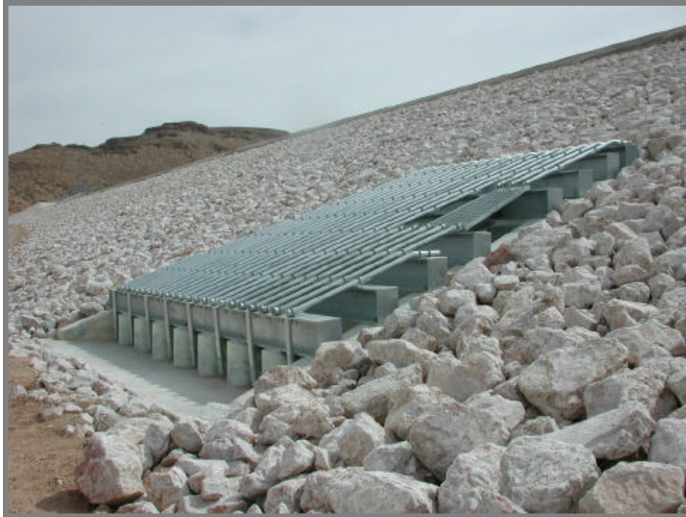
Photo 4. Blue Diamond Detention Basin . Outlet works trash rack.