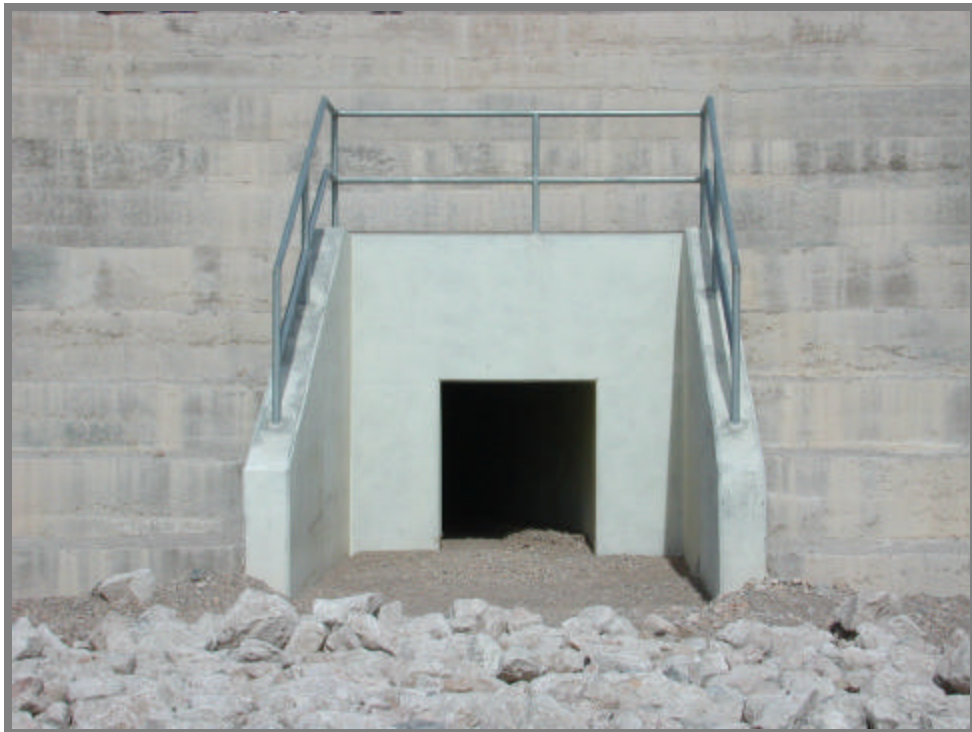
Photo 9. Blue Diamond Detention Basin . Downstream end of basin bypass conduit.