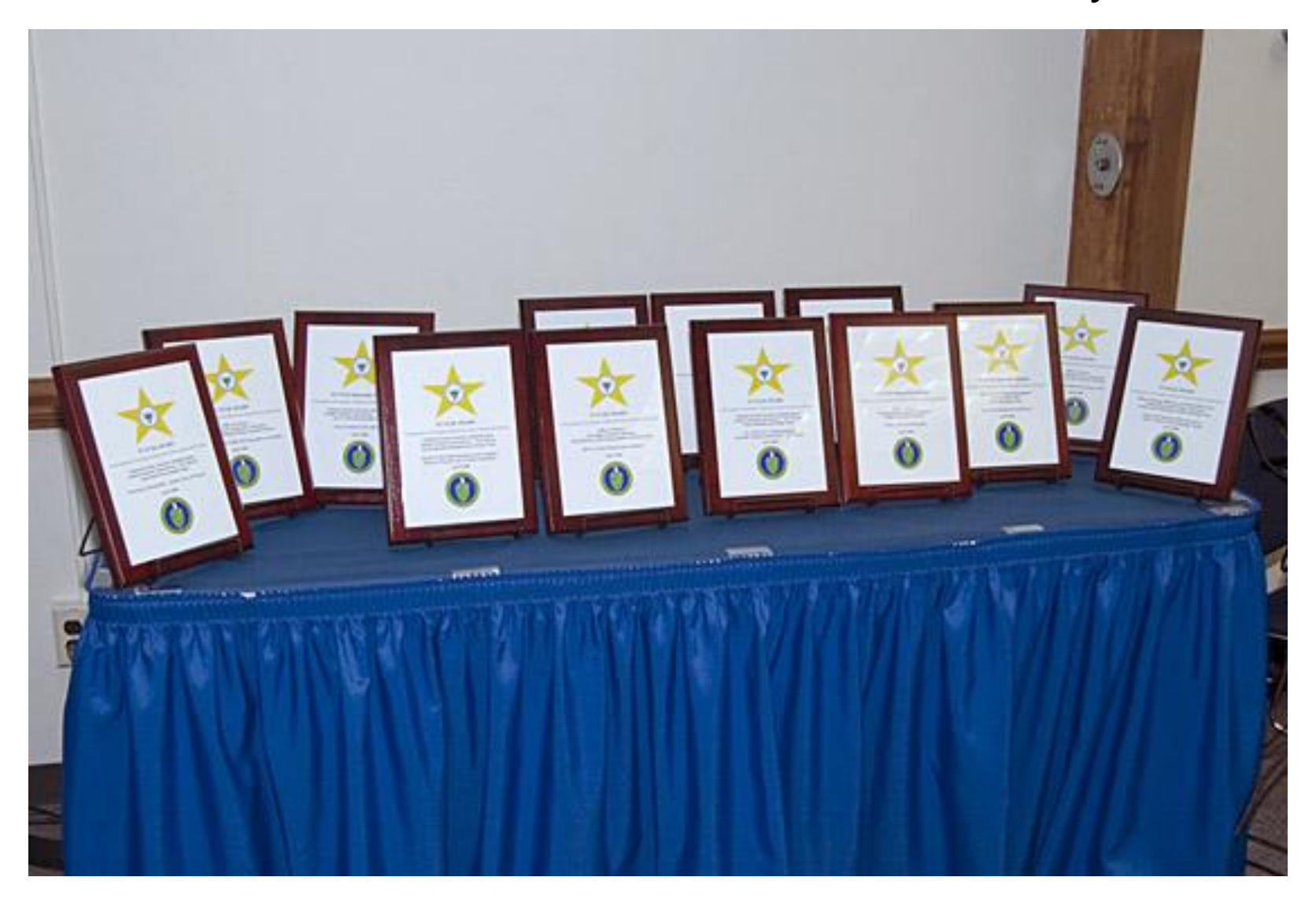
Display of 2008 P2 Star Awards