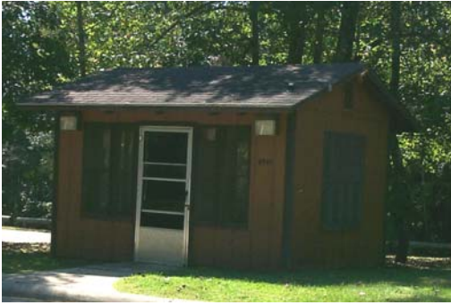
Fish Cleaning Station