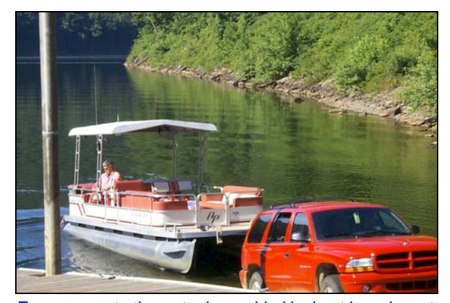
Easy access to the water is provided by boat launches at either end of the lake with ample trailer parking available.

The lake and its miles of unspoiled shoreline offer unlimited opportunities for water-based recreation. Watercraft of all types and sizes can be found on Tionesta Lake, from powerboats of unlimited horsepower with water skiers in tow to sleek canoes and small fishing boats plying the inlets, coves and backwater areas of the lake.