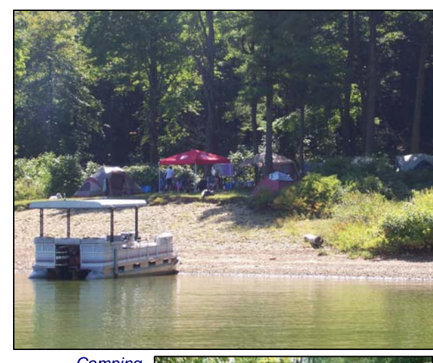
Camping facilities range from rustic in nature, located at lakeside and accessible only by boat, to campsites equipped with full hook-ups.

Campers will find a welcome change of pace from everyday urban life at one of Tionesta's many tree-shaded campsites.