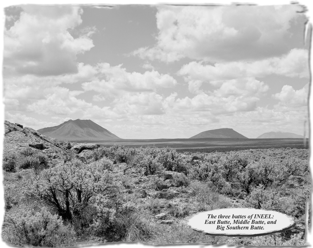
The three buttes of INEEL: East Butte, Middle Butte, and Big Southern Butte.