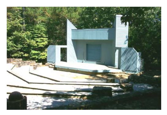
Weekend programs are available at the amphitheater from Memorial Day through Labor Day.