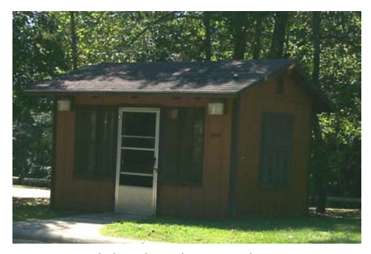
Fish Cleaning Station